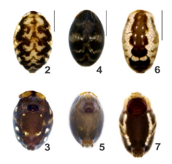
Figures 2-7: Female abdominal patterns and spots of three Neriene species. 2. N. clathrata , dorsal view. 3. N. clathrata , ventral view. 4. N. furtiva , dorsal view. 5. N. furtiva , ventral view. 6. N. radiata , dorsal view. 7. N. radiata , ventral view. Scale lines: 2: 0.7 mm, 4: 0.8 mm, 6: 1 mm.

Material examined: Düzce Province: 2, 07.11.2014, Dadalıköy village, leg. B. Badur; Kırklareli Province: 2, 1 subadult male, 02.04.2016, 41°03'00"N, 27°11'14"E, 574m. leg. H.B. Ergene; İstanbul Province, Aydos: 1 \bigcirc , 30.06.2016, 40°51'11"N, 29°14'49"E, 874m. leg. R.S. Kaya, E.A. Yağmur, Y. Gürkan.