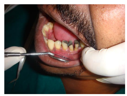
Figure 5. Suters removed after 7 days.

Post operatively first week the surgical site was stable with adequate healing (Figure 5).