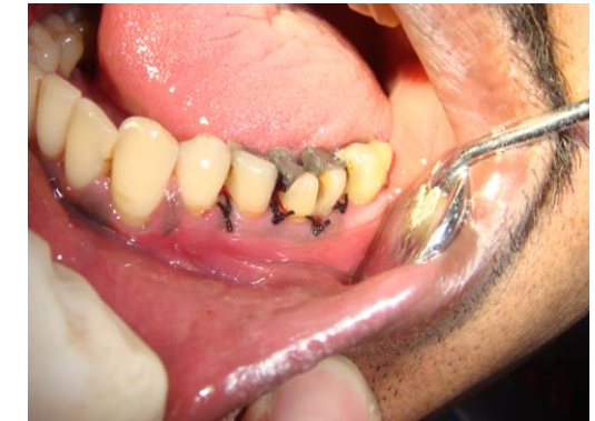
Figure 4. Repositioning of flap with sutures.

Along shank tapered fissure carbide bur was used to make vertical cut toward the bifurcation area. The furcation area was trimmed to ensure that no residual debris were present that could cause further periodontal irritation. Scaling and root planning of the root surfaces, which became accessible on separation was done. The occlusal table was minimized to redirect the forces along the long axis of each root. Then the flap was repositioned and sutured with 3/0 black silk sutures (Figure 4).