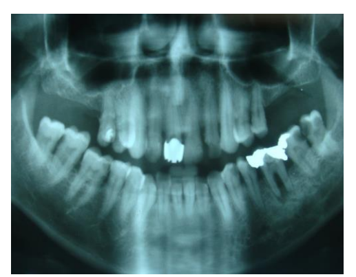
Figure 2 Panoramic radiograph (OPG) showing furcation defect in left mandibular first molars.

However there was a periapical lesion related to mesial root. Occlusaly amalgam restoration was involving the distal pulp horn of molar. Indicative of primary endodontic and secondary periodontal lesion.