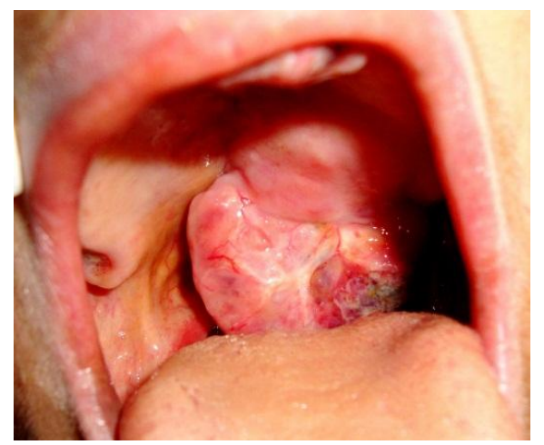
Figure 1: Left side of palate showing a single ovoid mass obstructing the oropharyngeal area. The surface on the posterior aspect shows erythematous surface with superficial varicosities and an area of ulceration.

On intraoral examination, a single ovoid mass [Figure 1] was seenon the left side of hard palate extending posterior to obstruct the oropharyngeal area. The overlying surface on the posterior aspect of mass was erythematous with superficial varicosities and an area of ulceration. On palpation the swelling was rubbery in consistency, sessile and non tender except in the ulcerated area. Neck examination was found normal. Further patient was subjected to maxillary occlusal radiograph which revealed no evidence of bone involvement. Fine Needle Aspiration Biopsy was performed, which was suggestive of Pleomorphic adenoma.