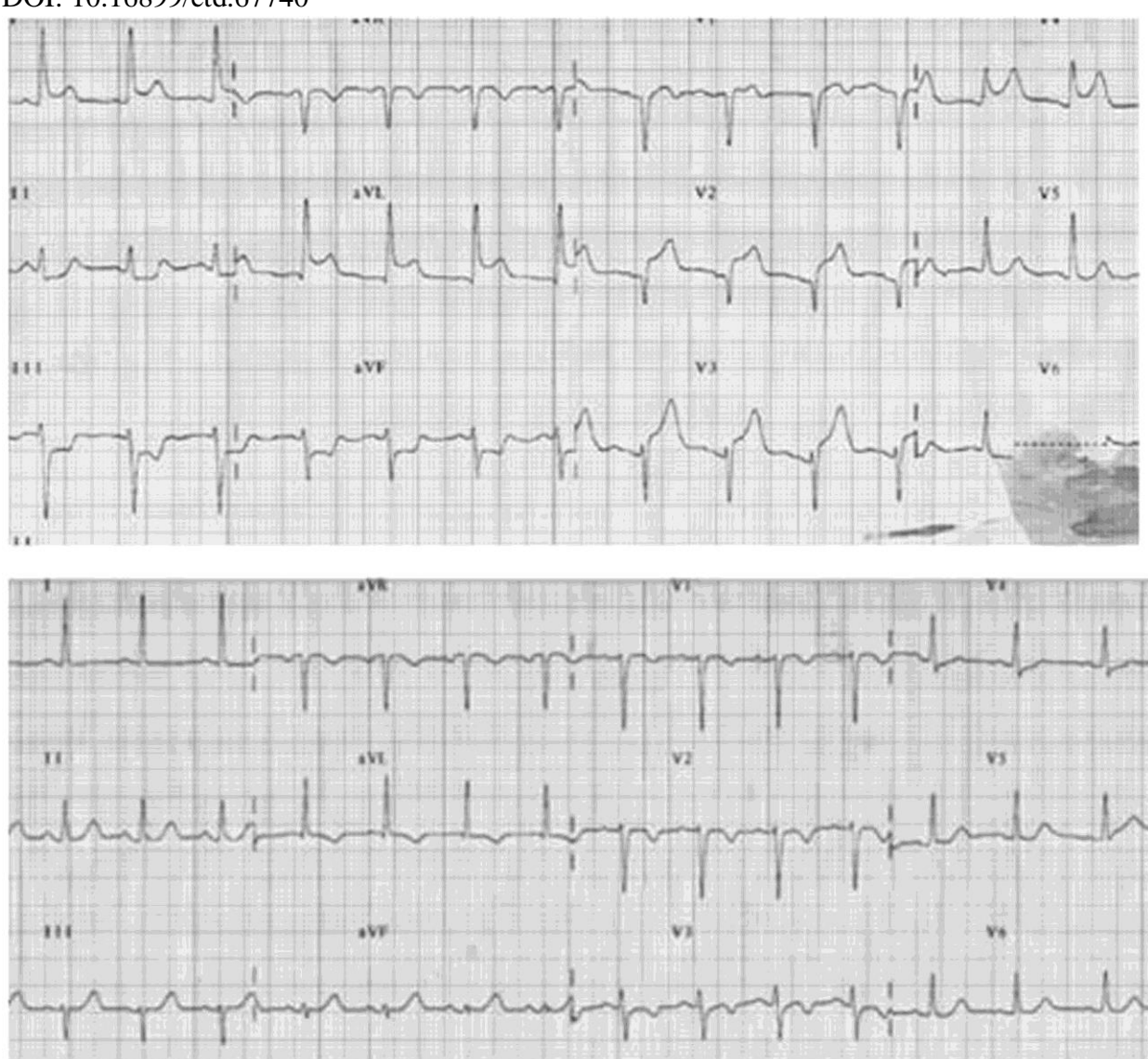
Figure 2: ST-segment changes: (a) ECG during angina attack; (b) ECG after pain episode.

Journal of Contemporary Medicine 2015;5(2):127-130 DOI: 10.16899/ctd.67740