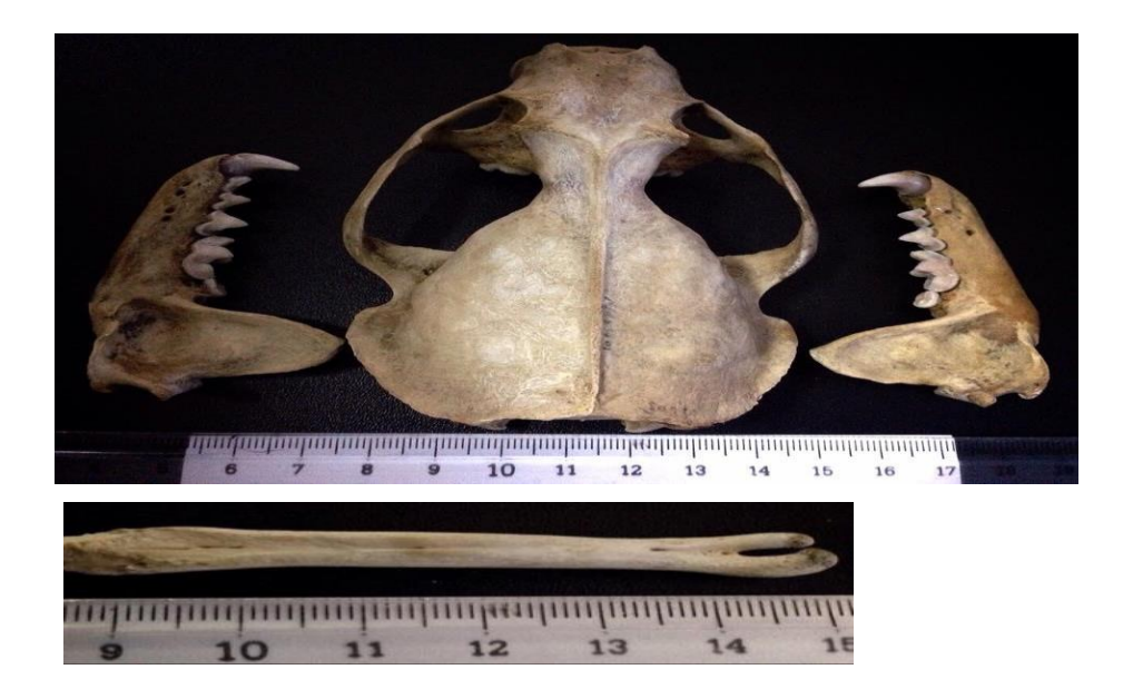
Figure 2. The cranium and bacculum of Lutra\ lutra .

cleaned by maceration technique [39]. A compass with 0.02 mm sensitivity is used to measure 17 internal character measurements of head skeleton and bacculum length [40] (Figure 2).