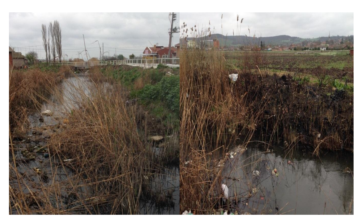
Figure 4. The channel where the Lutra lutra is obtained as a death specimen.

The otter sample is obtained dead near the irrigation channel where the human settlement ends (Figure 4)