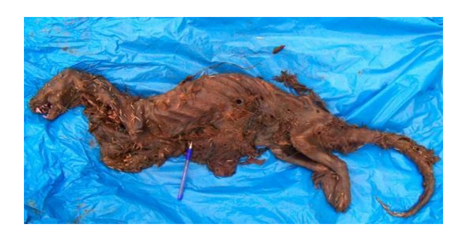
Figure 1.The death body material of Lutra lutra specimen.

This research is based on a male otter sample shut by hunters in Salur locality of Manyas, Balıkesir, Turkey at the february of 2014. The four standart external measures of the sample could not be included because of its biological destruction (Figure 1).