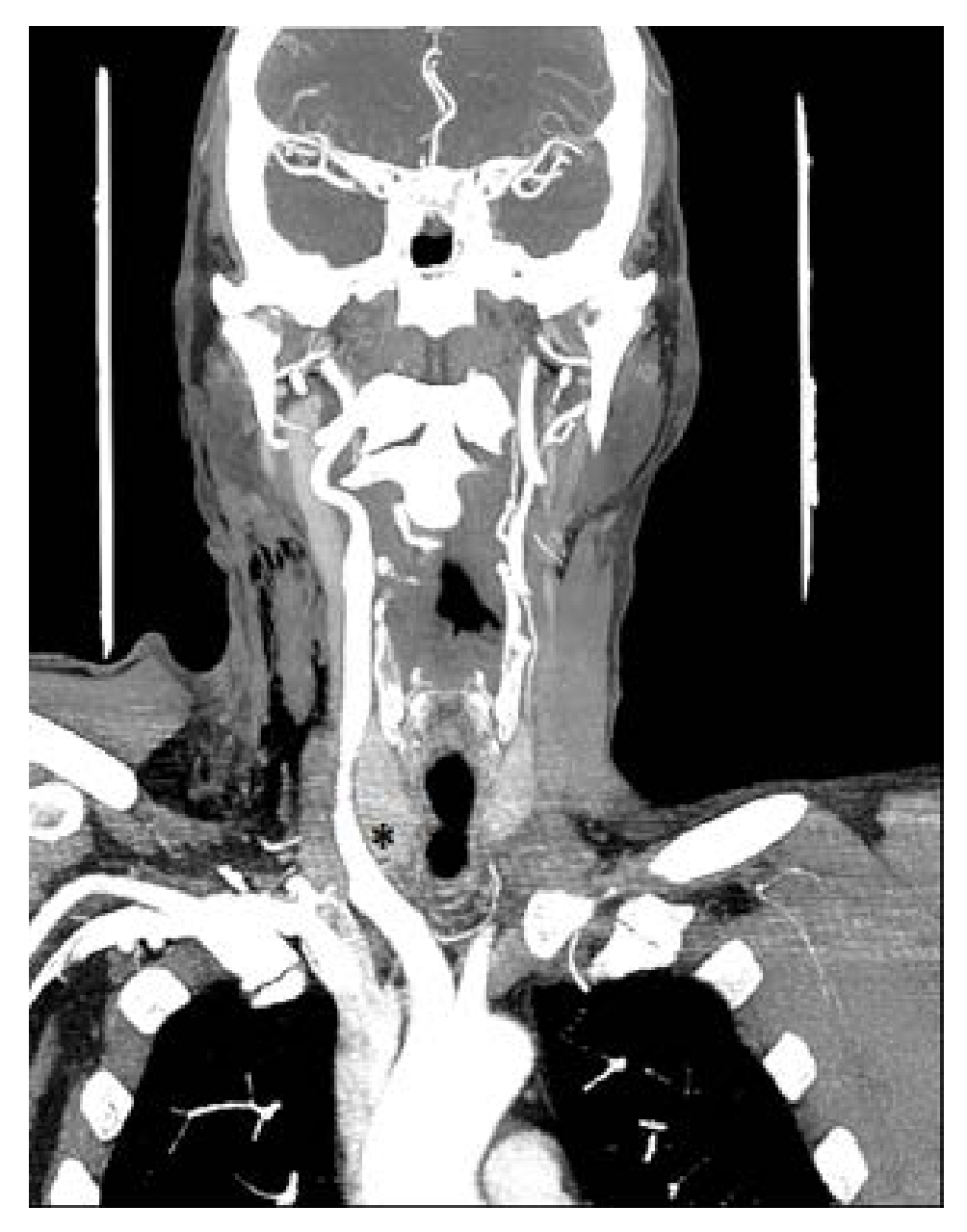
Figure 2. Angiogram shows the high-riding innominate artery (*)

Tracheostomy is opened between the second and the third tracheal rings paying attention not to touch the aberrant innominate artery. After the surgery, the angiography supported the diagnosis of the high-riding innominate artery (Figure 2).