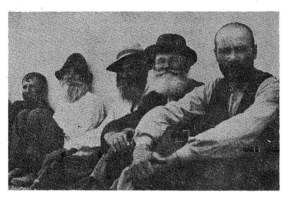
Figure 5. Old Cossacks of Kocagöl.

The next day was a holiday. In the evening all the villagers, their holiday clothes shining in the sunset, were out in the street. That season more wine than usual had been produced and the people were now free from their labours. In a month the Cossacks were to start on a campaign and in many families preparations were being made for weddings. Most of the people were standing in the square in front of the Cossack government Office and near the two shops, in one of which cakes and pumpkin seeds were sold, in the other kerchiefs and cotton prints. On the earth embankment of the office-building sat or stood the