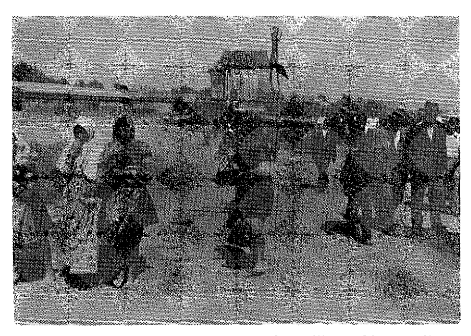
Figure 3. The girls promenading at the mill, cracking sunflower seeds.

day. Smoking was prohibited. Among them there was just one man who smoked a pipe. He was a deviant character, yet was tolerated by his group because he acted as mediator between the patrons of fisheries and the village labourers for the gurbet season. On festive occasions like weddings or holidays, ail the inhabitants of the village invariably overdrank. Even the babushkas (old women) of the village were tipsy and joined the dancing on the streets and merry-making. I know, for I was urged to join them as their friend, kunak several times during their wedddings, an obligation and honour which no kunak and later on a «special matron» (sagdich) at a wedding had a right to refuse. The weddings usually took place after the harvest and lasted for three days. It was a very festive occasion more or less the whole village taking part in the festivities. The wedding festivities started after the church ceremony which was very long, full of rituals and very complicated. The first evening after the ceremony a banquet was given in the bride's home to the womenfolk of the bridegroom. On the second day a banquet was given to the mem-