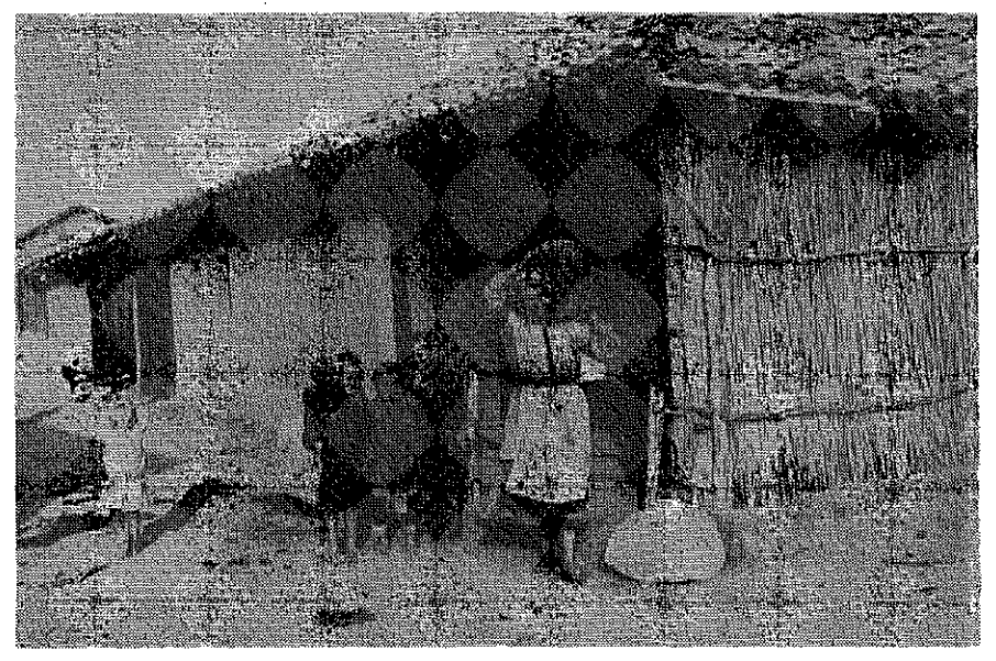
Figure 2. Woman with a heavy burden on her shoulder.

The choice of the setting of the village of Manyas Cossacks by the Lake was, of course, not accidental since these Cossacks just like the Terek Cossacks depended on agriculture, as well as fishing for their livelihood. Most of the families owned farms of from about 15-20 acres up to a thousand acre. They also owned herds of cattle and grazed them on the common pasture of the village. They mostly grew beans, maize, millet and sunflowers. In the gardens all sorts of vegetables, fruits, vines, watermelons, melons and pumkins are grown. Mostly women worked in the fields and the gardens, whereas