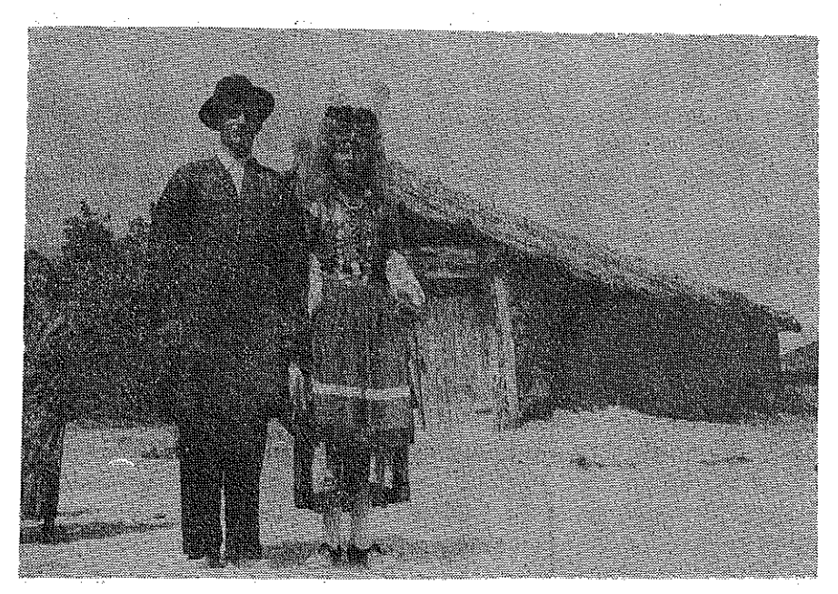
Figure 4. A newly wed Cossack couple.

Actually, it is scenes from everyday life and Tolstoy's artistic rendering of them that fills one with a sense of déjà-vu rather than historical facts or quantitavite data about these people.