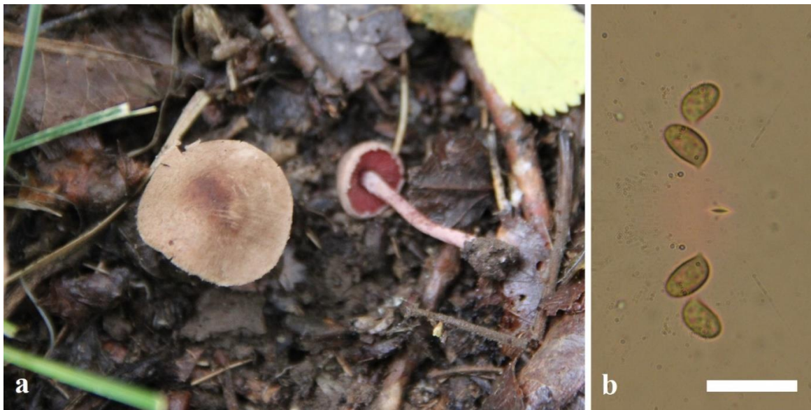
Figure 2. Basidiocarps (a) and basidiospores (b) of Melanophyllum haematospermum (bar: 10 µm).

Görecek old village, meadow, 39°04'881"N, 43°45'514"E, 1813 m, 19.05.2015, (Çağlı et al., 2019).