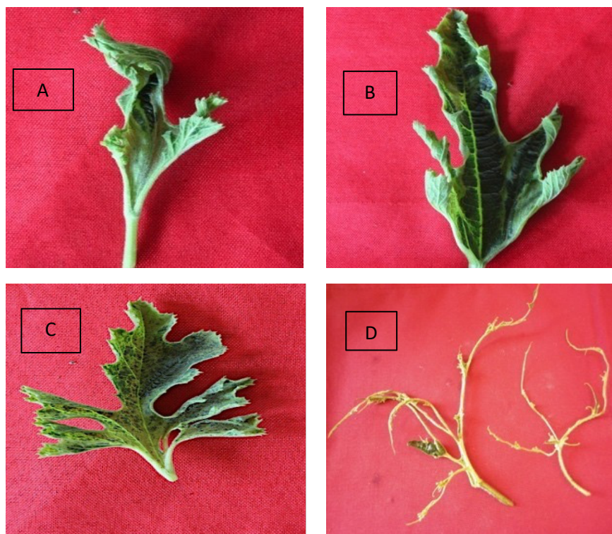
Figure 2. The variations on mosaic disease symptoms in zucchini (A) malformation, (B) leaf distortion, (C) blistering, (D) shoe-string