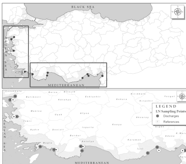
Figure 1. Sampling locations of the nutrient enrichment experiments in the NE Mediterranean and Aegean coastal areas.

Nutrients (Silicate, \text{NO}_3+\text{NO}_2\text{-N} , ammonia and \text{o-PO}_4 ) were analyzed using a Brann-Luebbe (Technicon) Autoanalyzer II following slightly modified standard methods (Grasshoff et al. 1983; APHA, AWWA and WPCF 2005). Samples for Chl- a analysis were filtered through GF/F filters. The filters were extracted in 90% acetone in the dark for a night. Following the extraction, absorbance was measured by fluorometric method according to Holm-Hansen et al. (1978).