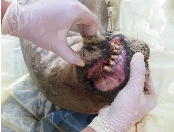
Figure 3. Gingivitis and tooth enamel erosion

Extensive pneumothorax was observed on the right lung that may be caused by an infection. Trachea was clear, esophagus was empty. In the oral cavity there were living cestodes and nematodes (Figure 4). They were collected and kept in the glycerine alcohol solution for further analyses.