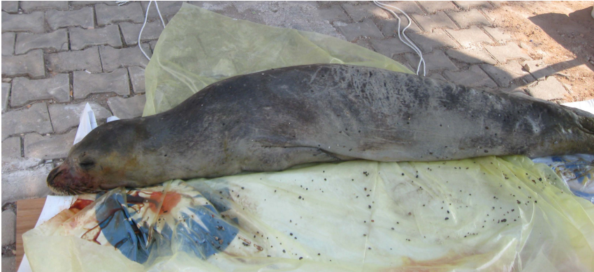
Figure 2. The female Mediterranean monk seal stranded in Antalya

On the abdomen, there were three black circular marks approximately 2 cm in diameter. Eyes were normal and mouth was hardly closed. Gums of teeth were massively eroded and gingivitis was observed (Figure 3). Erosion of gums proved that the seal was an old and malnourished individual. Extremities showed normal formation. The seal was observed to have skinny vertebrae so articulations could be easily seen.