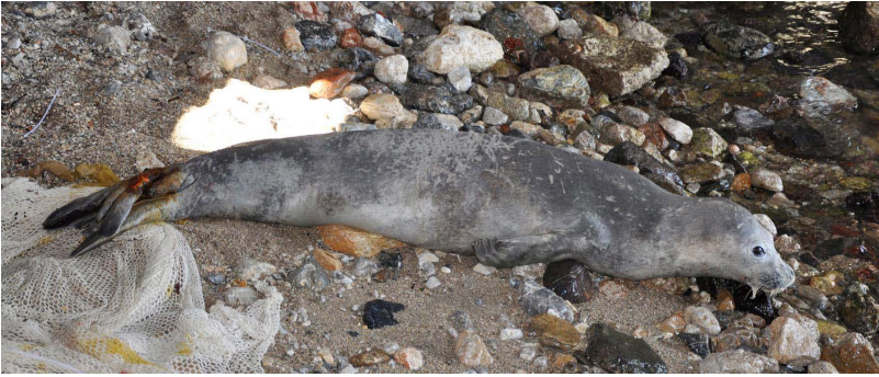
Figure 1. The female Mediterranean monk seal stranded on 6 July 2013 in Alanya

On the abdomen, there were three black circular marks approximately 2 cm in diameter. Eyes were normal and mouth was hardly closed. Gums of teeth were massively eroded and gingivitis was observed (Figure 3). Erosion of gums proved that the seal was an old and malnourished individual. Extremities showed normal formation. The seal was observed to have skinny vertebrae so articulations could be easily seen.