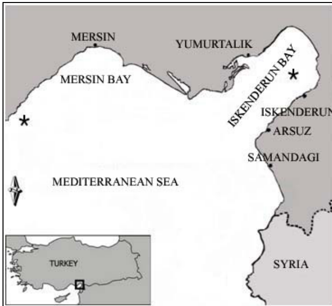
Figure 1. Sampling locations