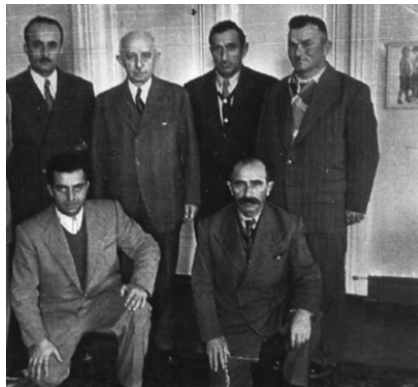
Figure 1. The Delegation of leaders of dolphin hunting (Karabacak Reis from Sürmene, Muzaffer Nuhoglu from Akçaabat Mersin village and Mustafa Reis from Zavena (Salacık) (Malkoç), Prime Minister Hasan Saka and President of Turkey İsmet İnönü (Zengin 2011)

their request (Zengin 2011) (Figure 1). Turkey continued the cetacean fishery until 1983. Presently, all cetaceans are under the legal protection in the Turkish waters.