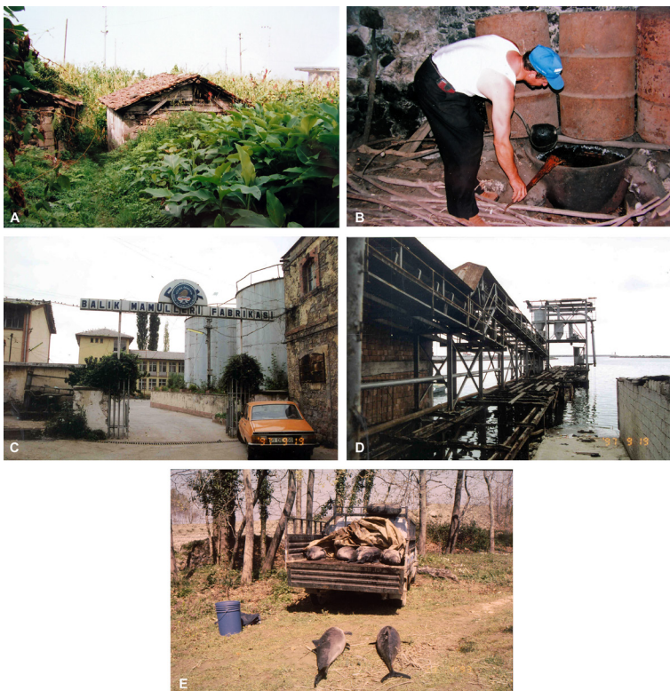
Figure 2. A) An old little hut still existing in one of the dolphin fishermen's garden. This old hut had been used for homemade production of dolphin oil until 1983. B) A farmer showed us how they produce oil from dolphin blubber with this old and handmade equipment before 1983. C) Entrance of EBK Factory in Trabzon. This plant has been unused since 1983. D) The port of entry to the plant from the sea. E) Bycaught harbour porpoises for processing in Yakakent in 1993.

Yakakent, after the 1970's, they stripped the skin of 150-200 dolphins in a day. They simply boiled blubber in pots to obtain oil. The processing of blubber of 30-40 individuals took a whole day. On the following day, they filtered the oil with cloth and obtained 2-3 barrels of oil from the boiler. The remaining portion was called 'kıkırdak (cartilage)'. They used it as fuel for thermo process and for a second process for oil. This 'black' oil was added to the first processed oil. In a season they sold 150-200 barrels (30-40 t) of oil.