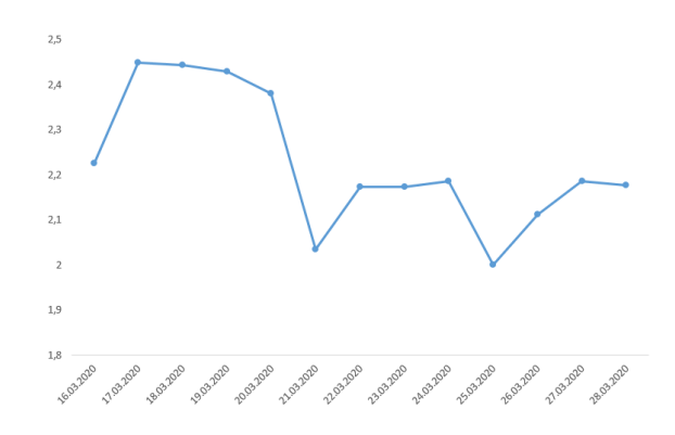
Figure 1. Reproductive number of COVID-19 in Turkey between March 16 and March 28, 2020.

The reproductive number (R) of COVID-19 in Turkey at early stage of pandemic between March 16 and March 28, 2020 had a waving structure even if there were some decreasing attempt (Figure 1).