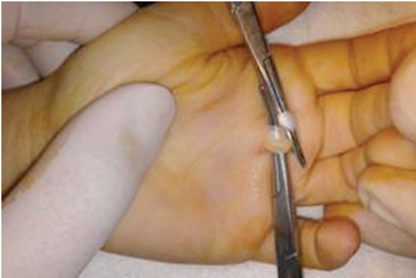
Figure 1. Radial part of FDS tendon is in normal size but the ulnar part of the tendon is enlarged and contains a lipid mass which later shown to be myxoid degeneration of the tendon