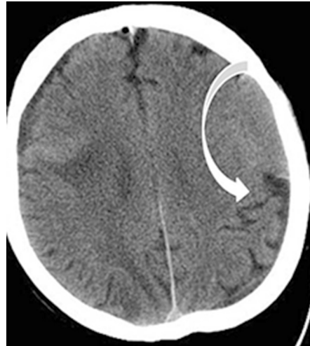
Figure 3. Left sided isodens lentiform image on computed tomography