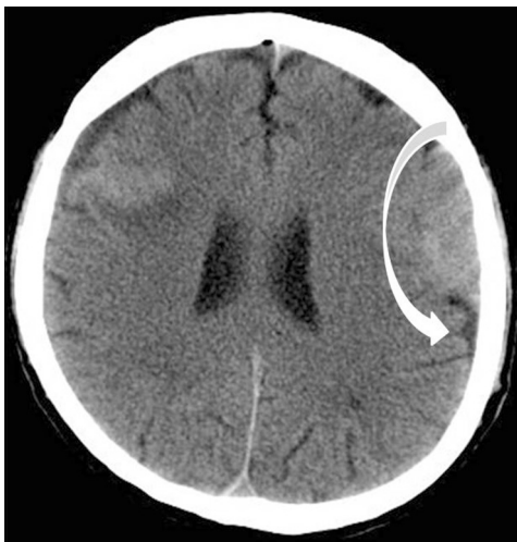
Figure 1. Left sided hyperdens lentiform image on computed tomography

We decided to follow him up in the intensive care unit because of using enoxaparine and ASA. 5 days later, he underwent operation by opening two burr holes bilaterally. After the operation early dropping of his right arm and drowsiness were disappeared. On the second day after operation control CT images of brain were taken and lentiform shaped hyperdens image (5x6 mm in size) was seen on left temporal lobe. We didn't think re-operation because of the intact neurological status of the patient. Ten days after operation control CT images were taken again and it revealed acute lentiform shaped image which was bigger than the first control image (Figure 1). We still didn't think re-operation, hematoma leaved to spontaneous resorption.