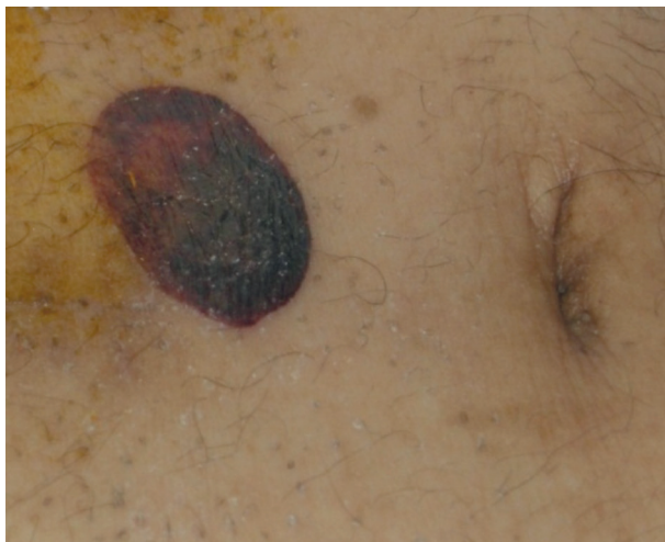
Figure 1. Sharply circumscribed, annular and hemorrhagic lesion in the anterior abdominal wall