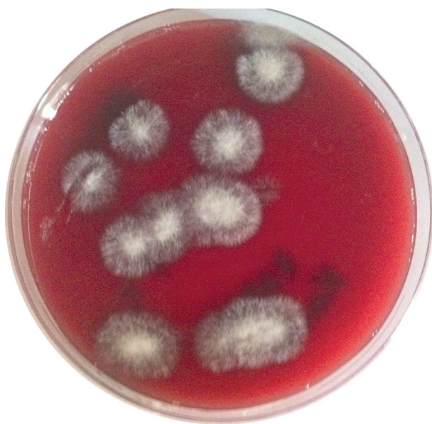
Figure 1. Colony morphology of Scedosporium apiospermum on brain heart infusion (BHI) agar

A 68-year-old male attended the Ophthalmology Clinic at Istanbul University, Faculty of Medicine on July 25, 2011. He presented six weeks duration of pain, lacrimation and a 'foreign body' sensation in the left eye. His past medical history revealed a sustained trauma with dust of the left eye six weeks ago. The patient was neither immunocompromised nor diabetic, except for being contact lens user. The patient presented with a stromal infiltrate with feathery margins, of uncertain etiology, in the cornea and hypopyon. Clinical and microbiological samples for diagnostic procedures were taken from corneal tissue, contact lens and anterior chamber and inoculated on to Sabouraud dextrose agar (SDA) and brain heart infusion (BHI) agar by the ophthalmologist in the operating room on admission day. These plates were sent to the Micology Laboratory of the hospital and incubated at 27°C and 37°C. On the third day of incubation, a phaeoid mold was observed on the plate which was inoculated with corneal tissue sample at 27°C. No growth was detected on the remaining plates. The colony appearances of the fungus was dark olive-green to black and had a woolly surface (Figure 1). A direct microscopic preparation was performed with lactophenol cotton blue (LPCB) stain and pigmented fungal elements were observed. The hyphae of the fungus were septated and conidiophores were simple long or short. Conidia were singly and in some areas in small groups (Figure 2).