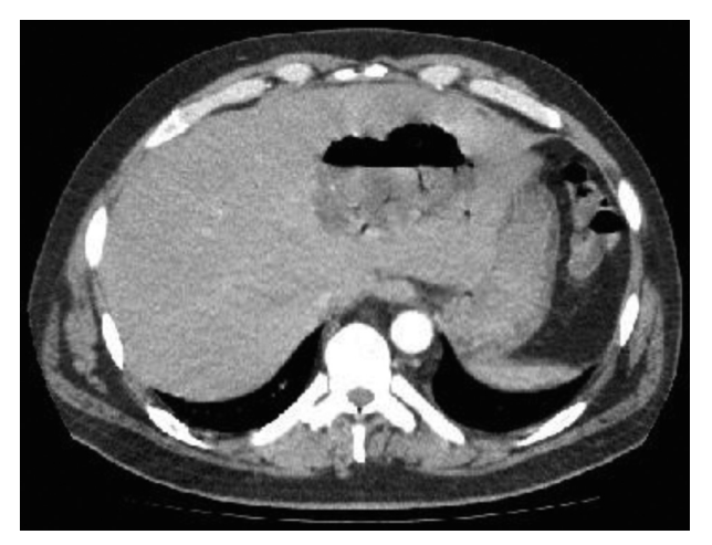
Figure 1. Hepatic abscess in the thorax CT

The patient was asymptomatic on the 30th day of the treatment. The drainage catheter was removed, oral sequential amoxicillin clavulanic acid was given, and the patient was discharged.