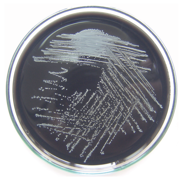
Figure 1. B. pertussis colonies on cough plate.

B.pertussis was detected in 28 suspected child patients ages from 6 months to 84 months among 700 subjects included in this study. Despite vaccination, pertussis was culture-confirmed in 28 children. Since the culture medium used for isolation of B.pertussis by cough plate method was selective, containing cephalexin, B.pertussis gave characteristics colonies that were smooth, raised, pin pointed with light metallic luster, resembling a drop of mercury (Fig.1).