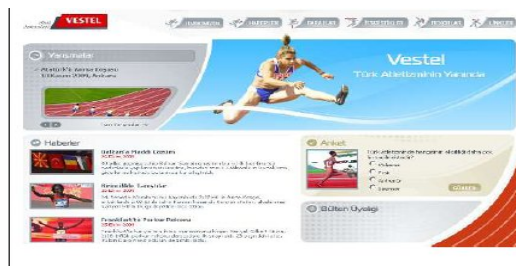
Figure 14. Vestel’s Support For Athletism