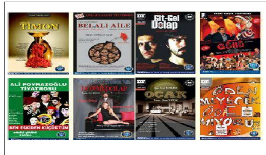
Figure 12. Efes' Social Responsibility Practices