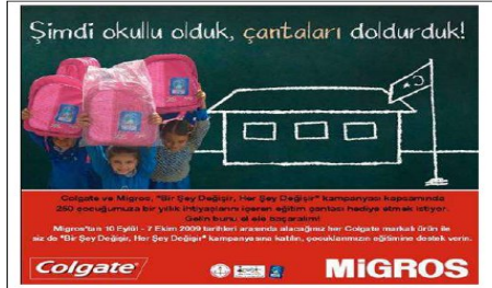
Figure 7. Colgate's Social Responsibility Project

Danone has carried out a project named as “Gülümseyen Gelecek Ana Sınıfları” with the support of “Ministry of Education” and “Çağdaş Yaşamı Destekleme Derneği” (See Figure 8). Within the context of this social responsibility practice, 250 nursery schools have been founded in different locations of Turkey [19].