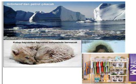
Figure 10. YKM's Social Responsibility Project