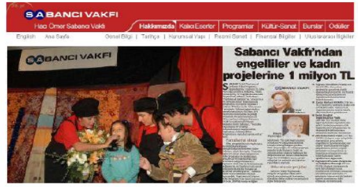
Figure 17. Sabancı Holding's Project

In cooperation with several non-governmental organizations and governorship of İstanbul, Hurriyet aims to reduce the violence in families and to make people conscious about the issue. Within the context of this project seminars were organized for families and also a music album was launched (See Figure 18). The sales revenue of this album is donated to the project [29].