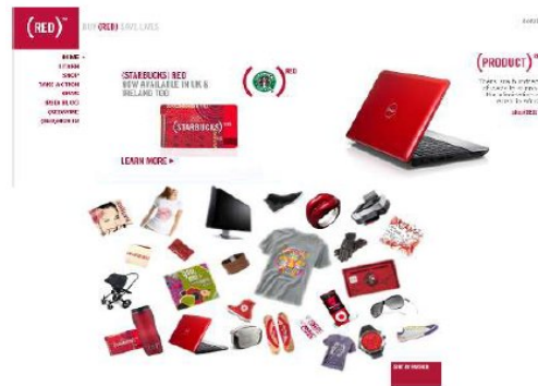
Figure 26. RED's special Red Products