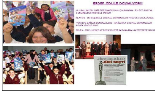
Figure 5. P&G's Social Responsibility Project .Source: http://www.pg.com.tr/procter/ , 2010

Turkcell's social responsibility project related to education is called “Kardelenler” (See Figure 6). This project aims to provide financial and moral support for young girls who are not able to go on their education or even haven't started their educations in rural areas [17]. Another company interested in educational social responsibility projects is Colgate . The firm gives customers the chance to support children's education by buying Colgate branded products in Migros (See Figure 7). The name of the project was “Bir Şey Değişir, Her şey Değişir” and its execution was supported by TOÇEV [18].