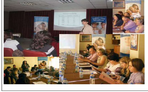
Figure 3. Tetra Pak's Social Responsibility Project

Examples of social responsibility projects in the education area: In the field of education related social responsibility, Cheetos, P&G, Turkcell, Colgate and Danone's projects are examined. nokta