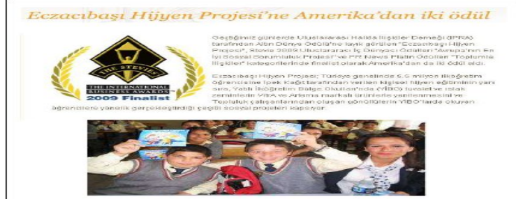
Figure 1. Eczacıbaşı: The Hygiene Project