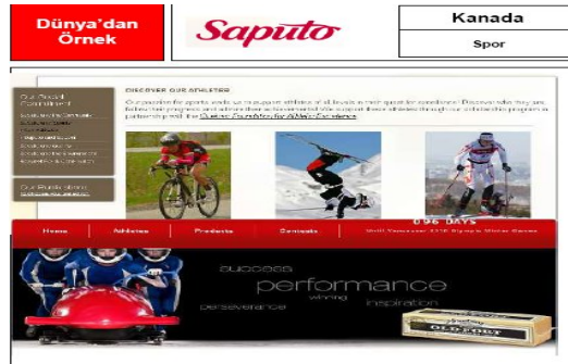
Figure 21. Saputo Supporting Sportsmen

The Case of Arla: Arla, a Swedish Company, publishes its social responsibility reports. The report is displayed on its official web site and summarizes its social responsibility practices mainly in the areas of environment, health, and agriculture on a yearly basis. The company has the ISO14001 and also the OHSAS18001 certificates on environmental standards. Arla announces that it obeys the internationally recognised environmental standards. In their report published in 2007, they pointed out that in their production process the amount of waste was significantly reduced. The following figure shows the examples of Arla's social responsibility [33].