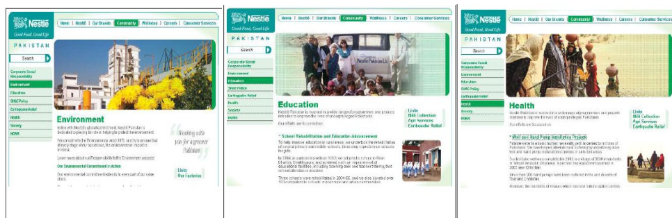
Figure 24. Nestle's Social Responsibility Practices In Pakistan

Nestle decides the type of the social responsibility project according to the social problems and troubles of the region where it operates. In Pakistan water scarcity is a major social problem. Because of that reason Nestle supported the project of drilling 300 new wells [36].