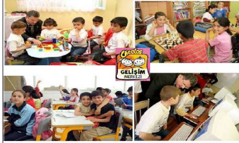
Figure 4. Cheetos' Social Responsibility Project