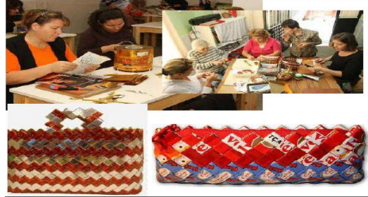
Figure 16. Unilever's Social Responsibility Project Source: copmadam.sabanciuniv.edu , 2010