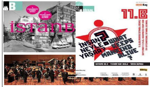
Figure 11. Koç Holding's Social Resp. Practice

One of the areas that Koç Holding carries out social responsibility projects is culture/arts (See Figure 11). Within the context of one of these projects Koç Holding undertakes the sponsorship of the International İstanbul Biennial [22]. Efes has also chosen the culture/arts area as its main social responsibility area and it has been supporting the Turkish Theatre for 14 years (See Figure 12). The company has undertaken the sponsorship of approximately 300 representations [23].