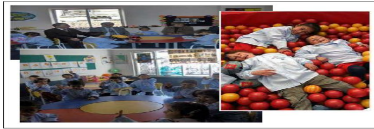
Figure 8. Danone's Social Responsibility Practice

Danone has carried out a project named as “Gülümseyen Gelecek Ana Sınıfları” with the support of “Ministry of Education” and “Çağdaş Yaşamı Destekleme Derneği” (See Figure 8). Within the context of this social responsibility practice, 250 nursery schools have been founded in different locations of Turkey [19].