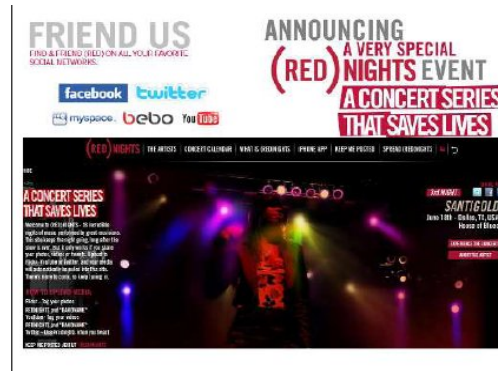
Figure 27. Concerts Organized by RED