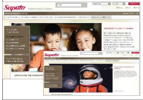
Figure 20. Saputo Supporting Children Source: www.saputo.com/consumers/social/ ,2010