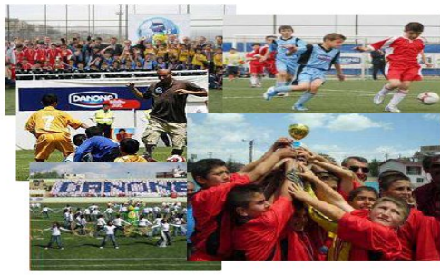
Figure 13. Danone’s Social Responsibility Practices

On the other hand Vestel , with its project named “Vestel Turk Atletizminin Yanında” undertakes some activities to support Athletism in Turkey (See Figure 14). Since 2004, with its social responsibility practices Vestel has been aiming to increase the attention and interest of Turkish youth on Athletism [25].