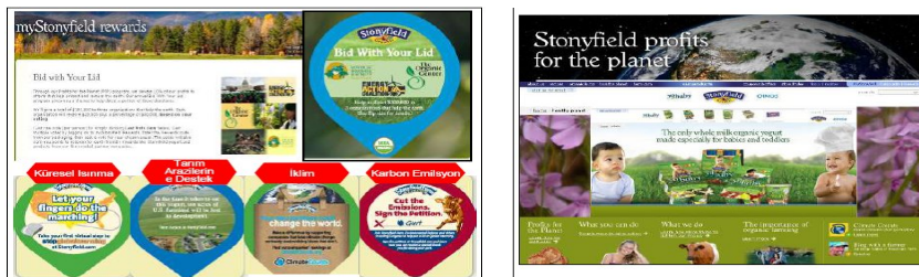
Figure 23. Stonyfield's Social Responsibility Practices

The Case of Stonyfield: Stonyfield, an American firm, puts information about their social responsibility projects and social messages on its yogurt covers. By this way it informs its customers about social responsibility projects and directs them (See Figure 23). Within the context of its “Profit for Planet” project every year it donates 10% of its profit to non-profit organizations dealing with environmental projects [34].