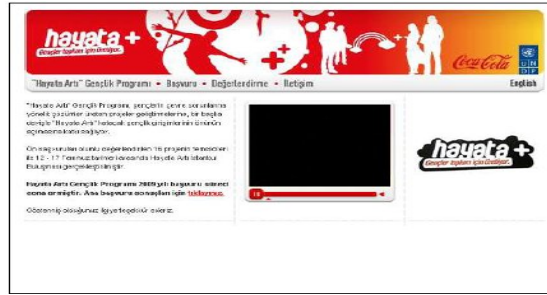
Figure 9. Coca Cola Turkey's Project

Coca Cola Turkey has organised a contest for young people who are between 16-26 years old (See figure 9). They design environment related projects for the contest and the ones that get high points from the jury are financially supported by Coca Cola, Turkey [20]. YKM carries out a social responsibility project with WWF (World Wide Fund for Nature) for the sake of environment. The firm produces products with panda logos and displays them for sale at specific stands in some of its stores (See Figure 10). The aim of this project is to increase public sensitivity for nature and to attract their attention to global warming. The income from the sale of these products is directly donated to WWF [21].