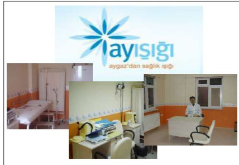
Figure 2. AYGAZ's Social Responsibility Project

Another social responsibility project in the field of health was executed by AYGAZ . For the company's 45th foundation day celebrations a project called "Ayışığı: Aygaz'dan Sağlık Işığı" was carried out (See Figure 2). In 45 different cities, Aygaz renovated 45 health centers' vaccine rooms [13]. Besides, Tetra Pak held a social responsibility project called "Sağlık İçin Sağlıklı Süt İçin", which was supported by the Ministry of Health. Within the meaning of this project Tetra Pak organized free seminars to inform nurses about how to avoid nutritional deficiency (See Figure 3). 1706 nurses were informed about the benefits of milk consumption and the features of healthy milk [14].