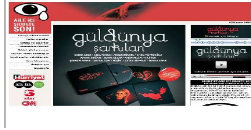
Figure 18. Hurriyet's Social Responsibility Project