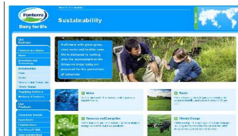
Figure 25. Fonterra’s Social Responsibility Projects Source: http://www.fonterra.com/wps/wcm/connect/fonterra.com/fonterra.com/our+business/sustainability/,2010 .

The Case of Danone: Danone undertakes several social responsibility projects in Bangladesh together with Muhammed Yunus who is the founder of Grameen Bank and also famous for social responsibility projects for the poor. Within the context of their projects, they found a little dairy for producing nutrient and cheaper yogurt. Danone also designs water purification projects for water beds in Cambodia aiming to supply healthy water [38, 39].