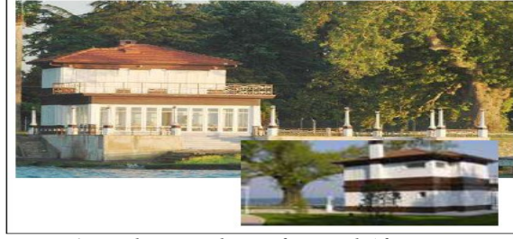
Figure 15. Yalova Köşkü, Before and After Restoration Source: www.calik.com/sayfa.aspx?id=8 , 2010.

Example of social responsibility projects in the area of history: Çalık Holding has provided financial support for the restoration of “Yalova Köşkü” because it is one of the houses in which Atatürk, the founder of Turkish Republic, lived in Turkey (See Figure 15) [26].