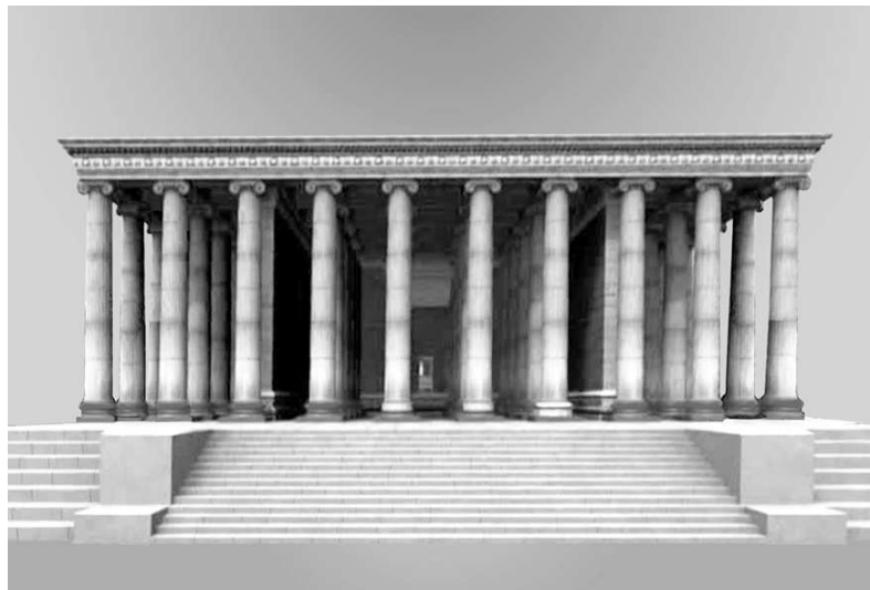
Figure 6. Reconstruction of Didymaion