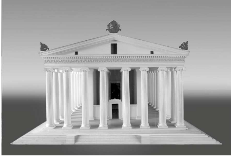
Figure 7. Reconstruction of Temple of Artemis at Sardis