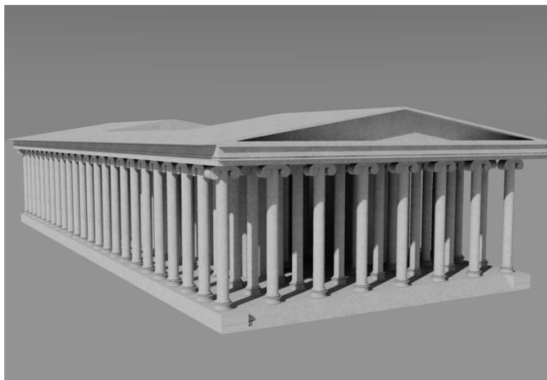
Figure 4. Reconstruction of Heraion (Polykrates) Temple