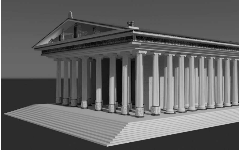
Figure 5. Reconstruction of Artemision (Classical Temple)