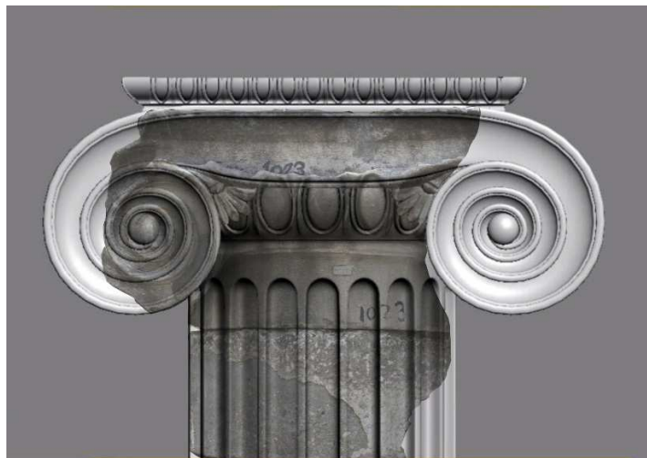
Figure 2. Reconstruction of an Ionic capital by using enhancement.