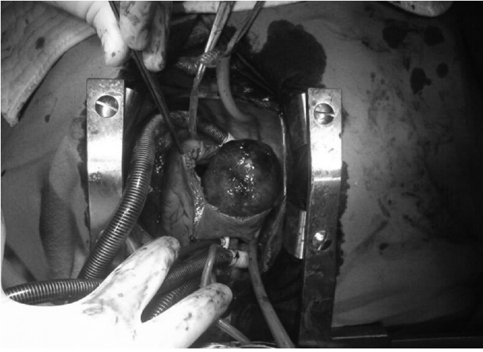
Figure 1: Intra-operative view of the right atrial myxoma

It was completely excised with its attachment and the consequential atrial septal defect was primarily repaired. No maze procedure was performed. The measurement of the mass revealed a lesion of 10 x 3 cm (Figure 2).