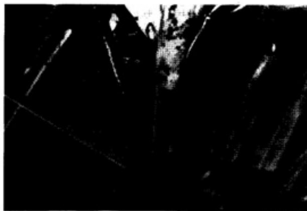
Figure 2. Intraoperative appearance of the giant eustachian valve.

Cor triatriatum dexter results from persistence of the entire right sinus venosus valve which forms a large, obstructive flap or a septum across the right atrium and divide it into two separate chambers. The upstream chamber receives superior and inferior vena caval flow, while the downstream chamber incorporates the right atrial appendage. In this situation, the venous flow is directed to the upstream chamber and subsequently crosses the atrial septal defect to the left atrium, resulting in a right to left shunt. As the membrane is usually perforated, there is also some flow across the membrane into the downstream chamber and through the tricuspid valve into the right ventricle. Echocardiographically, the membrane is generally running from the inferior vena cava to the superior vena cava, separating the right atrial appendage and tricuspid valve from the great veins. In elderly patients, this cardiac malformation can be differentiated from the giant eustachian valve dividing the right atrium, by demonstration of