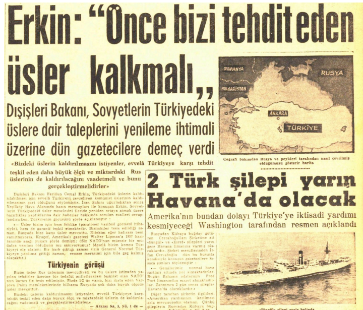
Figure 1: Erkin: “The missiles threatening us should be removed first” (Cumhuriyet, 1 November 1962)

To prevent a linkage, the USA expressed the differences between Cuban missiles and Jupiter missiles and why they should not be linked. Firstly, the USA argued that she did not secretly deploy the missiles to Turkey. It was an open process conducted by NATO and declared the will to the world in 1957. Unlike Cuban missiles or other missile bases of the USSR targeting the capitals of European countries, Jupiters and Thor missiles, according to the USA, were the tools for the collective defence of the allies. 52 When the USSR officials perseveringly asked for the removal, Foreign Minister of Turkey Cemal Erkin said that they knew Jupiters were both dangerous lightning arresters and a guarantee. To clarify; the missiles, though they were provoking a USSR strike to Turkey, were tools to be used when the country was under great danger. Nevertheless, to assuage the crisis, the Soviets should have initially removed the bases in Warsaw Pact countries threatening Turkey. 53