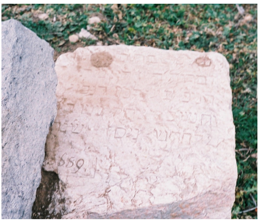
Photo (5): See Hebrew transliteration and English translation Nu. 5 (?)