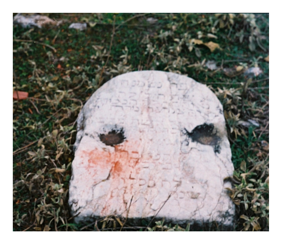
Photo (19): See Hebrew transliteration and English translation Nu.\ 19