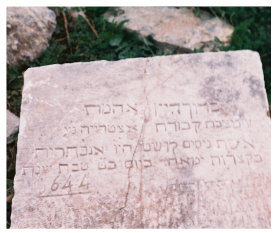
Photo (15): See Hebrew transliteration and English translation Nu. 15