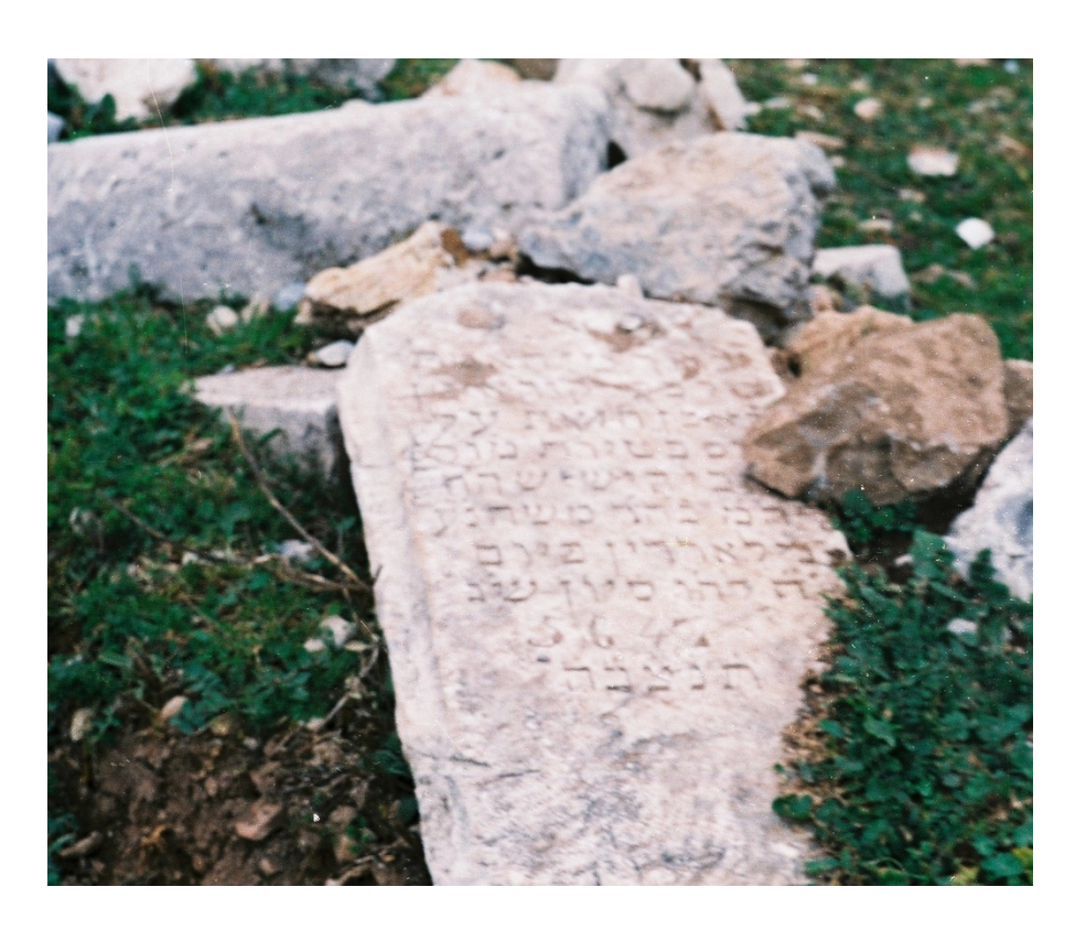
Photo (7): See Hebrew transliteration and English translation Nu. 7 (?)