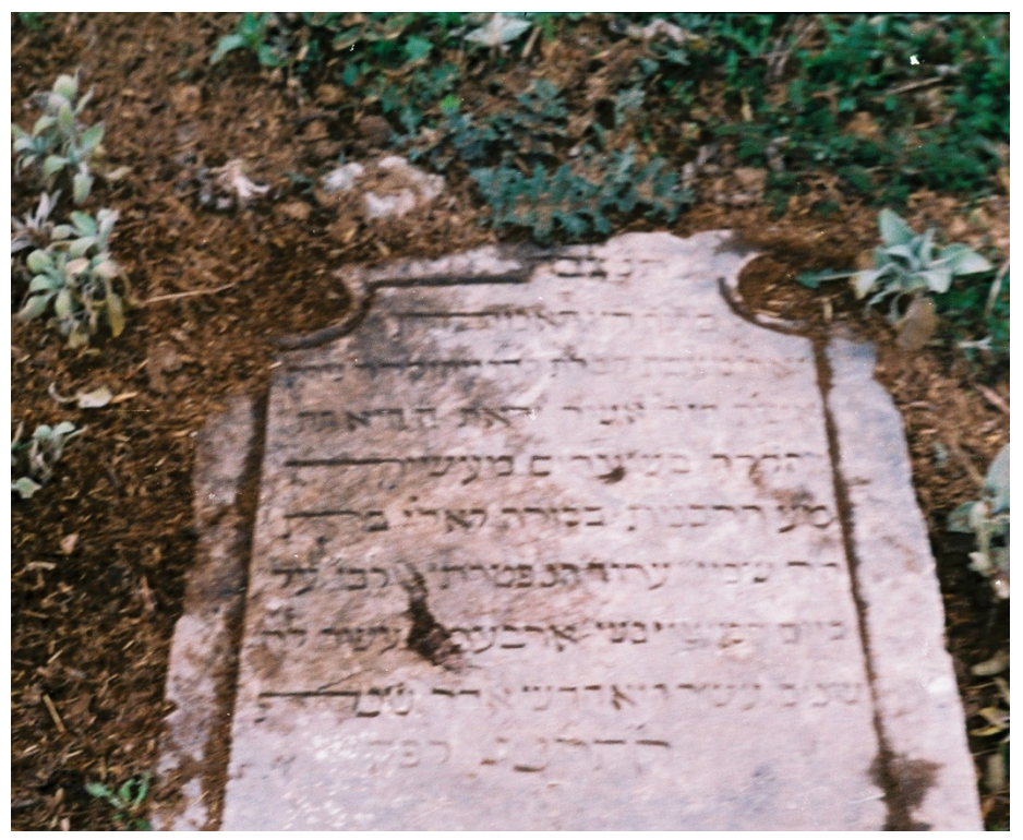
Photo (8): See Hebrew transliteration and English translation Nu. 8