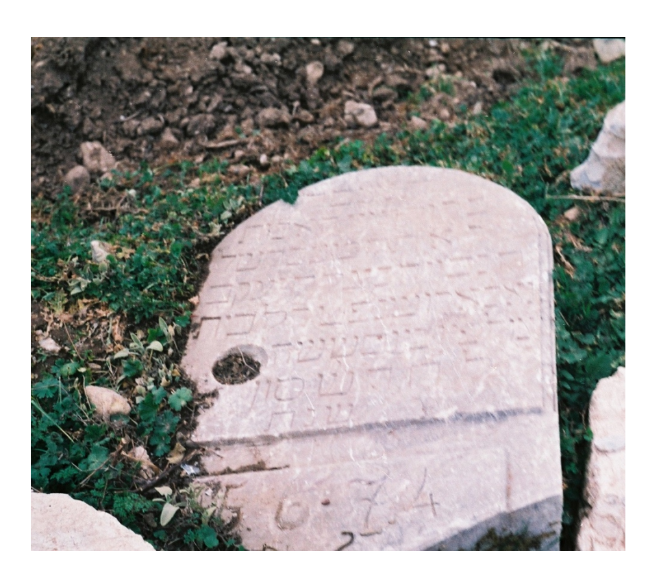
Photo (3): See Hebrew transliteration and English translation Nu. 3