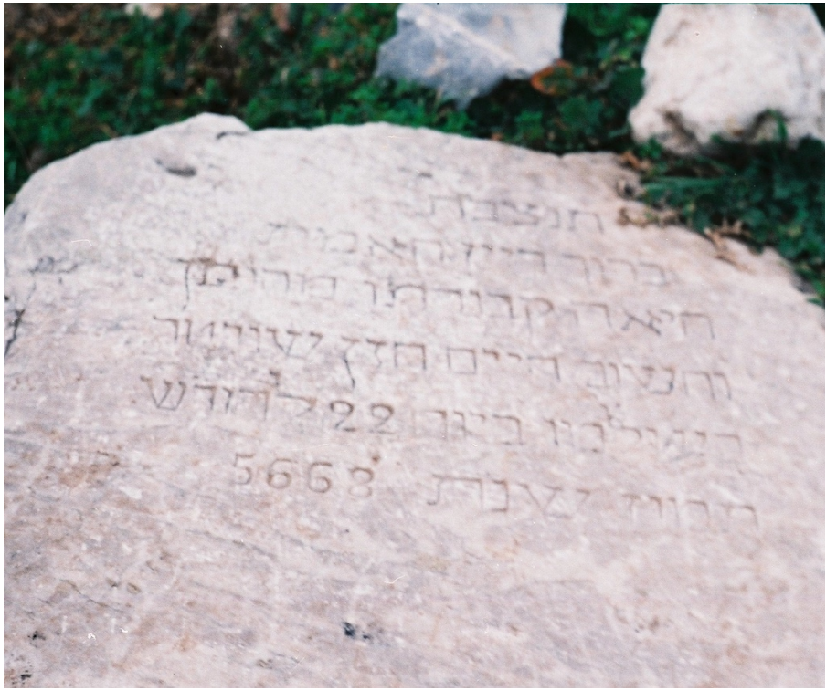
Photo (6): See Hebrew transliteration and English translation Nu. 6