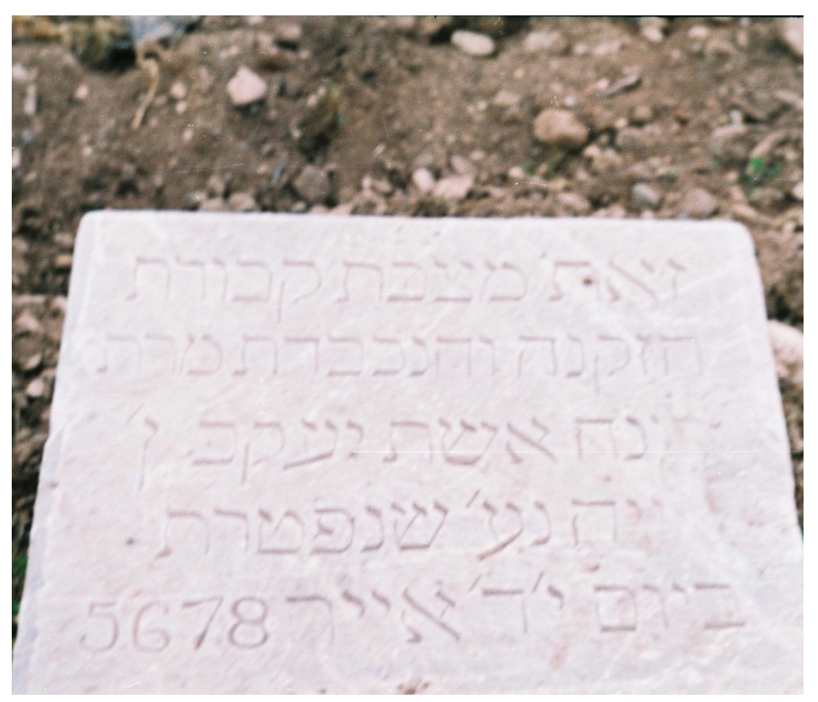
Photo (16): See Hebrew transliteration and English translation Nu. 16