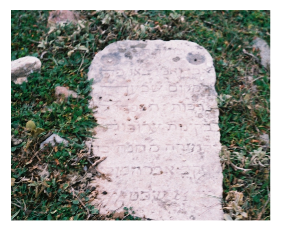
Photo (2): See Hebrew transliteration and English translation Nu. 2