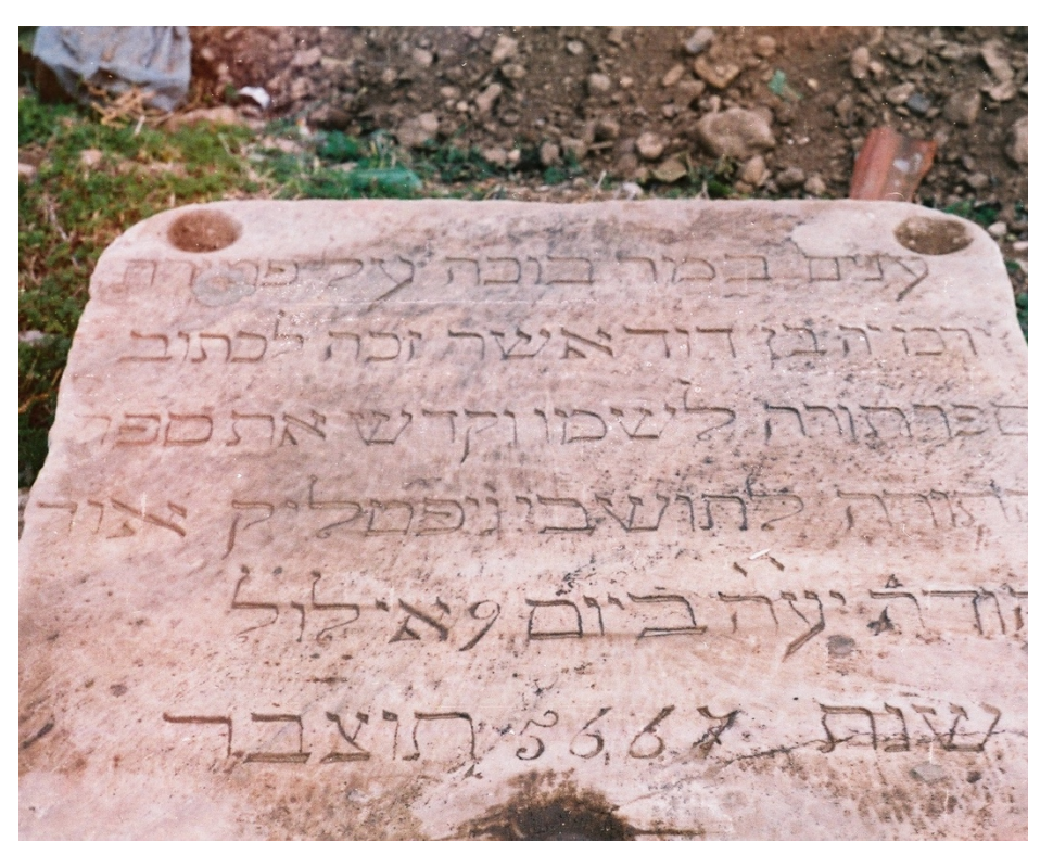
Photo (11): See Hebrew transliteration and English translation \operatorname{Nu} . 11