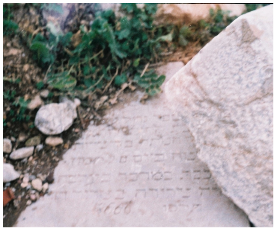
Photo (17): See Hebrew transliteration and English translation Nu. 17