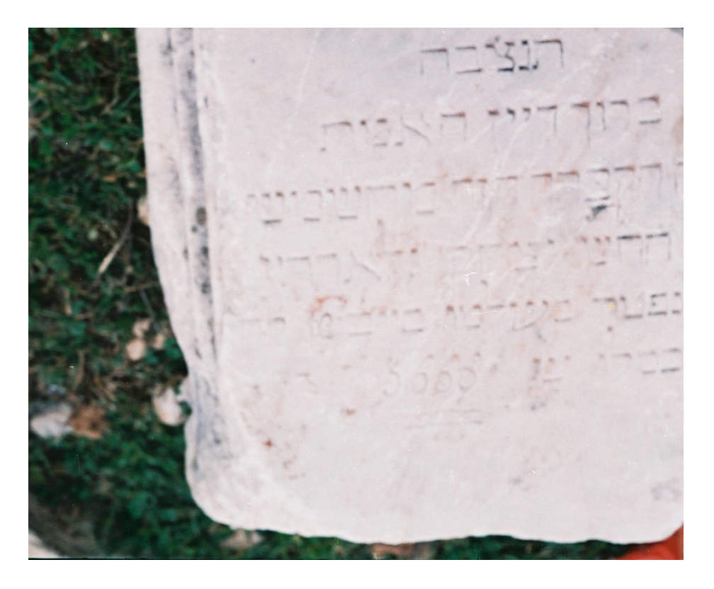
Photo (4): See Hebrew transliteration and English translation Nu. 4.