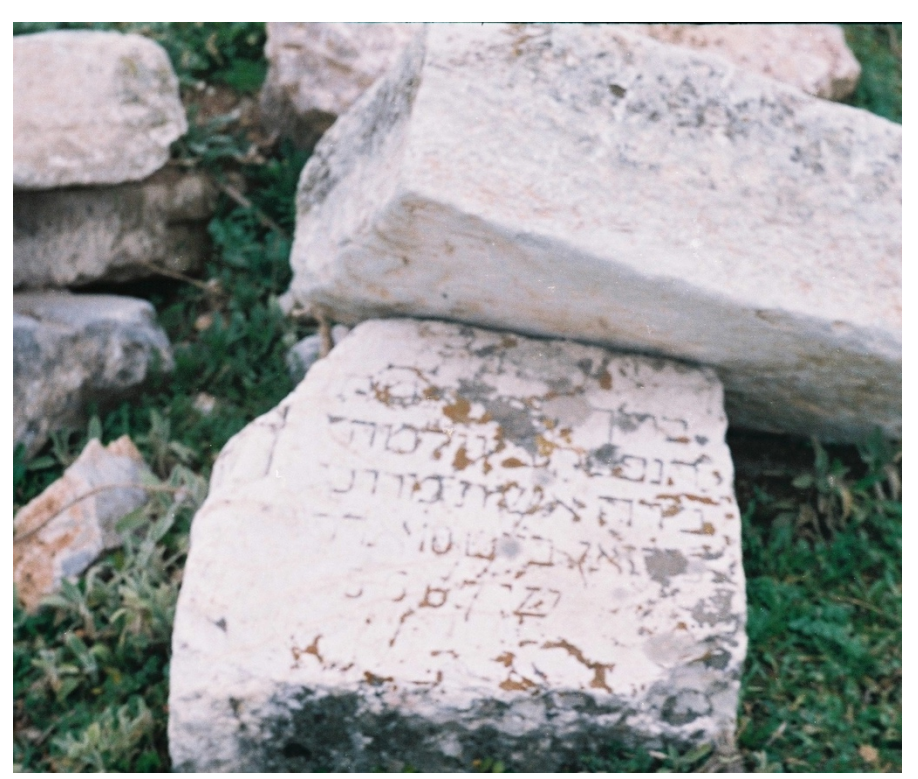
Photo (18): See Hebrew transliteration and English translation Nu. 18