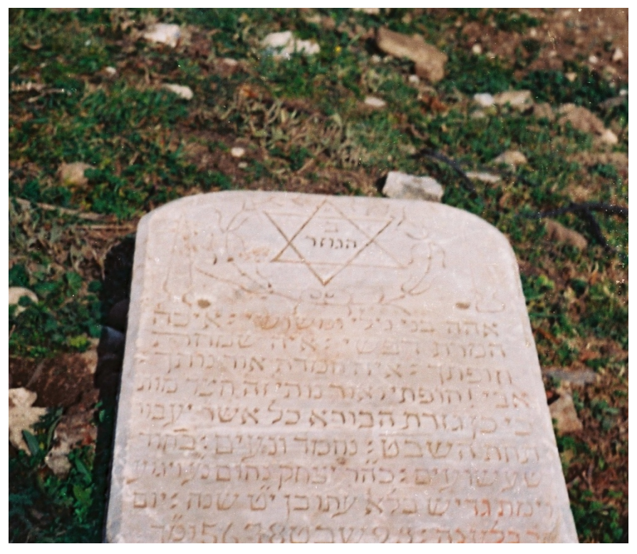
Photo (12): See Hebrew transliteration and English translation \mathrm{Nu}.\ 12