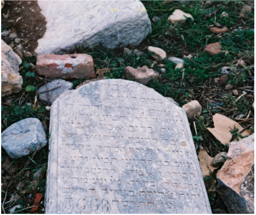
Photo (10): See Hebrew transliteration and English translation Nu. 10