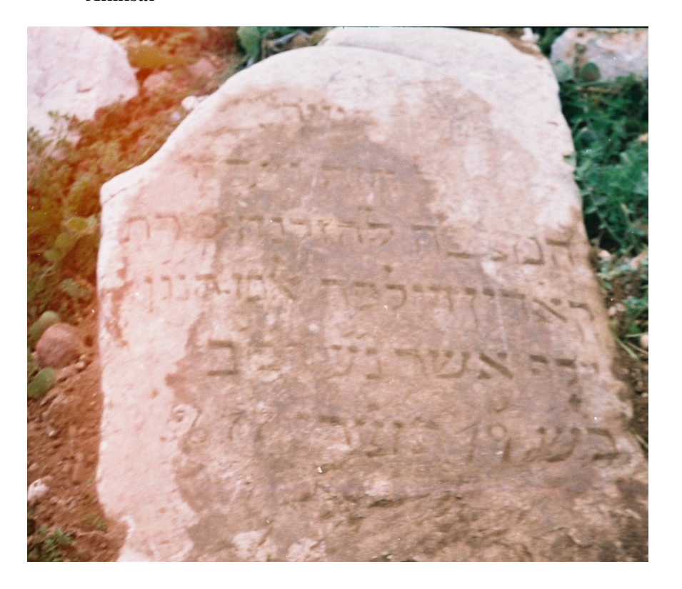
Photo (1): See Hebrew transliteration and English translation Nu. 1