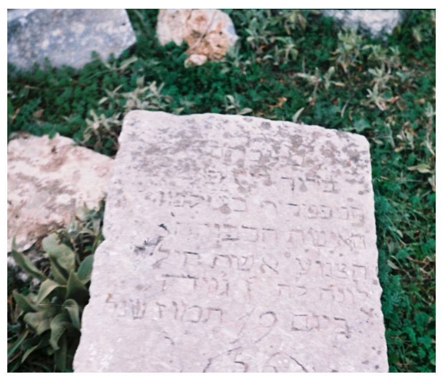
Photo (13): See Hebrew transliteration and English translation Nu. 13