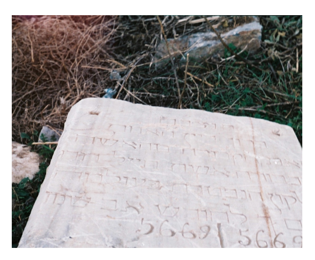
Photo (9): See Hebrew transliteration and English translation Nu. 9