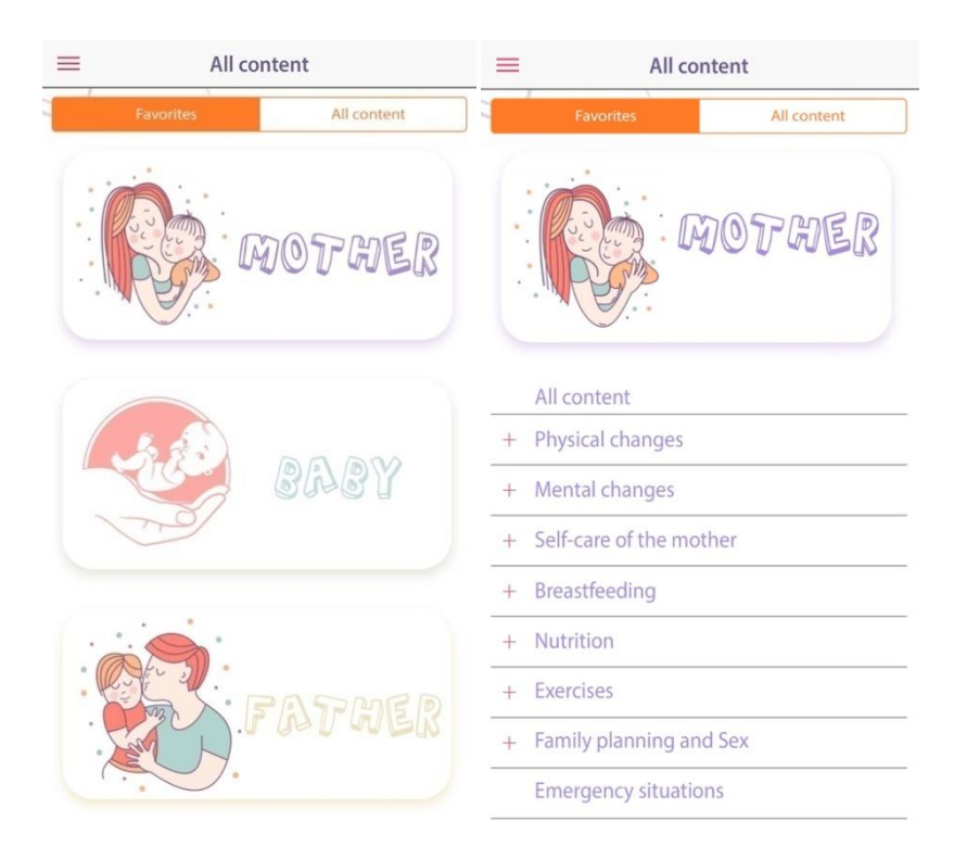
Figure 2. Mobile application image (prepared by Pınar Mallı)

of this mobile applicationarethat it is user-friendly, easy to understand, providing information content with training videos and providing one-to-one online message support to puerperant women and using it for IOS and Android operating systems. The researchers prepared the educational material, visuals and videos and questionnaires, scales and visuals were added to the mobile application, which was started after user and developer software tests were carried out (Figure 2). Users in experimental group supported with three catagories which are mother - father and newborn. For Mother: postpartum changes, mental changes, self-care of mother, breastfeeding, sexual health, reproductive health, postpartum exercise, maternal nutrician, emergency case, mother-baby attachment etc. For Father: role adaptation, participation to baby care, comminication with partner and sexual health etc. Newborn: newborn physiological characteristics, newborn care, breasfeeding, vaccine, common problems, baby development, emergency cases etc. The contents are enriched with videos that facilitate the application. For example; bath, diaper changes, breastfeeding and other problems etc. Online midwife support for questions of experimental groups.