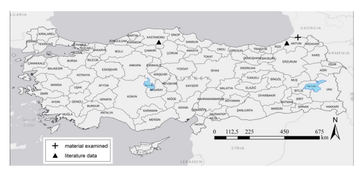
Figure 12. Distribution of Oxytelus laqueatus in Turkey.

Remarks. The material from Artvin represents third record from Turkey. It is a widespread species in the world (Schülke & Smetana, 2015). The species was found in all kind of decayed or rotting organic matter (Lott, 2009; Schülke, 2012a). In this study, the species is collected from broadleaved deciduous woodland.