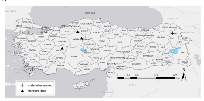
Figure 6. Distribution of Anotylus pumilus in Turkey.

Remarks. The material from Kars represents the third record from Turkey fauna. This species was found in dry dung (Schülke, 2012a). Similarly, in this study, the specimen collected in Irano-Anatolian steppes in dry cow dung.