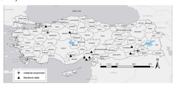
Figure 16. Distribution of Oxytelus sculptus in Turkey.

Remarks. This species was recorded for Batman and Eskişehir Provinces for the first time. It is a cosmopolitan species (Schülke & Smetana, 2015). This species can be found in compost and dung heaps (Lott, 2009; Schülke, 2012a).