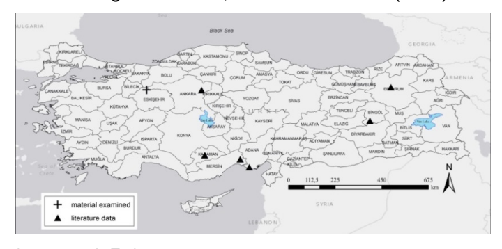
Figure 8. Distribution of Anotylus rugosus in Turkey.

Remarks. The specimens represent new record from Eskişehir. It is one of the most common rove beetles in Central Europe and Palearctic Region (Schülke, 2012a; Schülke & Smetana, 2015). It seems to be common in Turkey, but in this study only one specimen was recorded. Anotylus rugosus can be found in soil litter and on all kind of decayed remains (Lott, 2009; Schülke, 2012a). In this study, the species was recorded at light trap in the Pinus nigra woodland, as in Lane & Mann (2006).