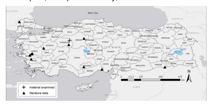
Figure 17. Distribution of Platystethus cornutus in Turkey.

Remarks. It is the most frequently encountered wetland Platystethus species. It breeds in mud and sand around ponds and rivers (Lott, 2009). In this study, it was also collected from around pond shores.