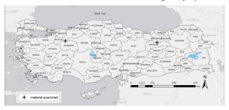
Figure 14. Distribution of Oxytelus pseudopiceus in Turkey.

Material examined. Eskişehir: Sarıcakaya, Laçin-Alapınar Road, 40°01'48.47"N, 30°48'08.64"E, 580 m, 17.06.2012, 4♂♂, ♀, Pinus nigra woodland, light trap, leg. D. Çiftçi; Gümüşhane: Kelkit, E of Yeniyol Village, 39°54'04.61"N, 39°24'54.82"E, 1876 m, 22.06.2011, ♂, leg. D. Çiftçi.