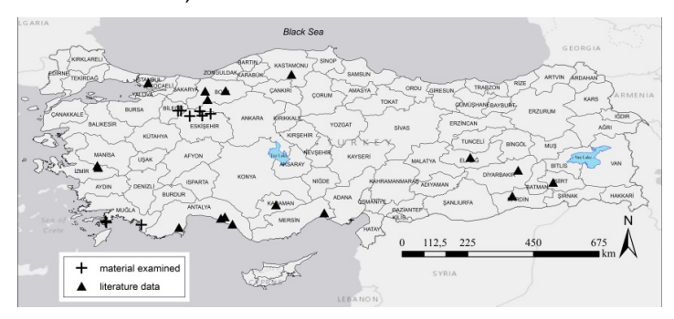
Figure 9. Distribution of Anotylus sculpturatus in Turkey.

Remarks. The species is new record all provinces listed above for the first time. It is one of the most common species of the genus in Central Europe and Palearctic Region (Schülke, 2012a; Schülke & Smetana, 2015). It is also common in Turkey. According to published data (Lott, 2009; Schülke, 2012a), the specimens were taken from cow dung. The specimens recorded from Turkey mostly collected from forest habitats (see material examined).