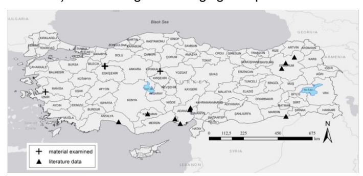
Figure 13. Distribution of Oxytelus piceus in Turkey.

Remarks. It is here reported from central and western Anatolia for the first time. It is a widespread species in the Palearctic Region (Schülke & Smetana, 2015). It can be detected in all kinds of digested matter, often flying (landing net in the light) (Lott, 2009). In this study, it was generally collected from forest habitats (thermophilus deciduous woodland, Pinus nigra woodland, mixed Mediterranean Pinus -thermophilus Quercus woodland) in cow dung also using light trap.