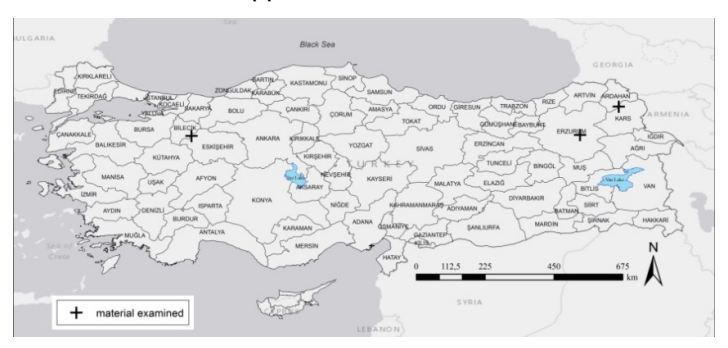
Figure 7. Distribution of Anotylus rugifrons in Turkey.

Remarks. This species is widespread in Europe, but rare everywhere (Schülke, 2012a; Schülke & Smetana, 2015). It is here reported from Turkey for the first time. Similar to the published data (Schülke, 2012a), the species was found in wet meadows and river bank. Also, in this study, it was collected from under the stone in the Iranian-Anatolian steppes.