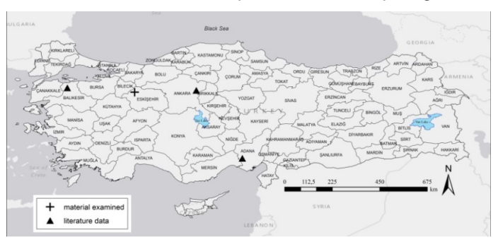
Figure 4. Distribution of Anotylus intricatus in Turkey.

(Schülke, 2012a). The species is recorded from several provinces of Turkey (Figure 4). In the present study, the species collected from moist or wet eutrophic and mesotrophic grassland habitat in cow dung.