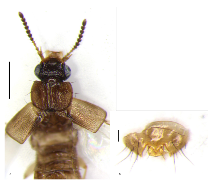
Figure 15. Oxytelus pseudopiceus: a) forebody (Scale: 0.5 mm), b) ♂ sternite VII (Scale: 0.1 mm).