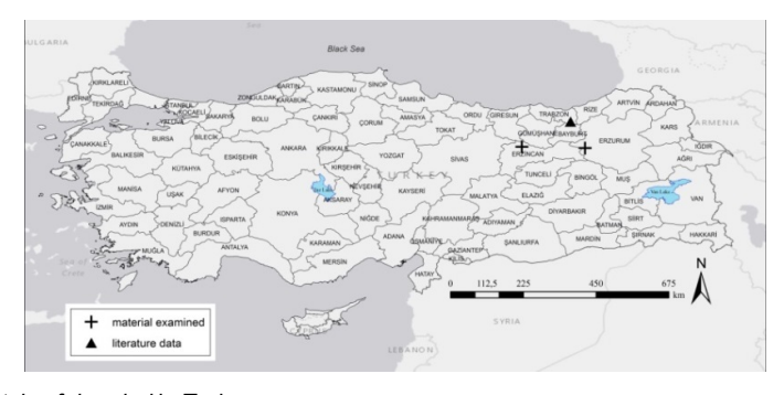
Figure 3. Distribution of Anotylus fairmairei in Turkey.

Remarks. The species had been reported from Trabzon Province. The specimens from Erzincan and Erzurum represent the third record from Turkey. In this study, it was collected from calcareous alpine and subalpine grassland habitat and moist or wet eutrophic and mesotrophic grassland habitat. Anotylus fairmairei is widespread and rare species in Central Europe, and recorded for all kinds of organic materials (dung and litter) (Lott, 2009; Schülke, 2012a). The species has only been found in several locations in east and north east part of Turkey (Figure 3). In the present study, specimens were collected from cow dung in different habitats.