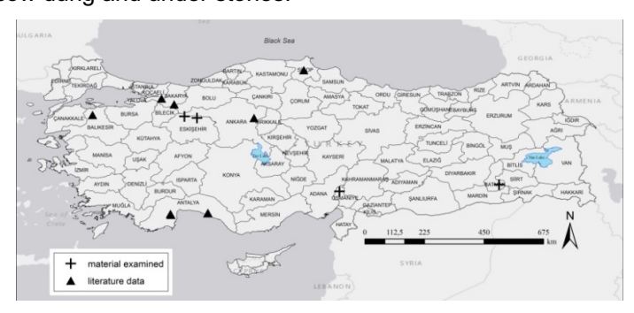
Figure 1. Distribution of Anotylus clypeonitens in Turkey.

Remarks. This species is reported here from Eskişehir, Osmaniye and Batman Provinces for the first time. The specimens were collected from various EUNIS habitats; mixed Mediterranean Pinus -thermophilus Quercus woodland, thermophilus deciduous woodland, Mediterranean riparian woodland, moist or wet eutrophic and mesotrophic grassland. According to published data, A. clypeonitens is found on rotting plant substances, especially in compost heaps (Lott, 2009; Schülke, 2012a). In this study, the species was found in cow dung and under stones.