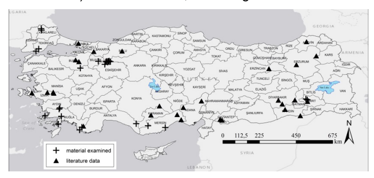
Figure 5. Distribution of Anotylus inustus in Turkey.

Remarks. This species is one of the most common and widespread species of Anotylus in Turkey. The species is recorded from several provinces of Turkey for the first time: Ankara, Antalya, Aydın, Bilecik, Çanakkale, Eskişehir, Kırklareli, Kütahya and Tekirdağ. Anotylus inustus was collected from wide variety of habitats (see material examined) in chicken feces, cow dung and under stones.