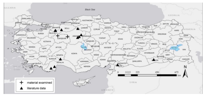
Figure 18. Distribution of Platystethus nitens in Turkey.

Remarks. P. nitens usually occurs in warm places with tightly compact soil, especially on lake shores, river banks, in fields and gardens. It can be found in detritus, compost, horse and cattle dung (Burakowski et al., 1979; Koch, 1989). In this study, this species was found in cow dung on wet meadow and river banks (in thermophilus deciduous woodland).