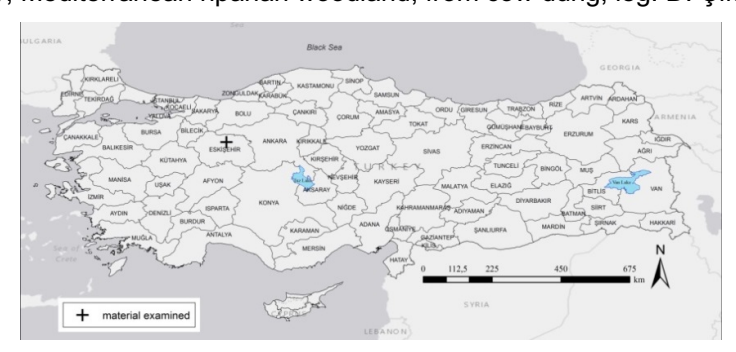
Figure 10. Distribution of Anotylus sexualis in Turkey.

Material examined. Eskişehir: Beylikova, 3.5 km along Doğanoğlu-Bozan Road, 39°49'N, 31°10'E, 862 m, 30.04.2012, ♂, Mediterranean riparian woodland, from cow dung, leg. D. Çiftçi.