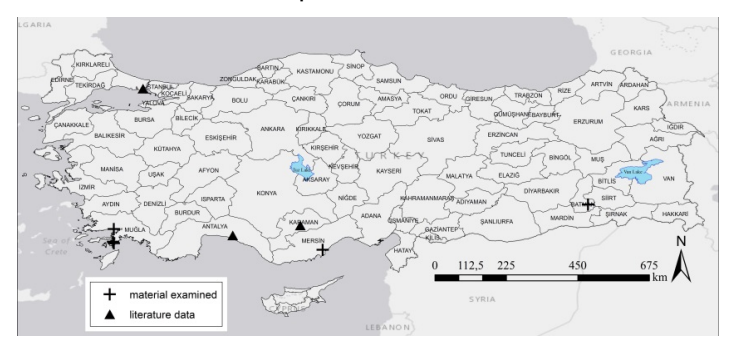
Figure 2. Distribution of Anotylus complanatus in Turkey.

grassland habitat. According the published data (Hammond, 1976; Lott, 2009; Schülke, 2012a), the species was found in all kinds of organic materials (dung and litter). In this study, one specimen was taken from under stone in wet meadow, habitats of other specimens are unknown.