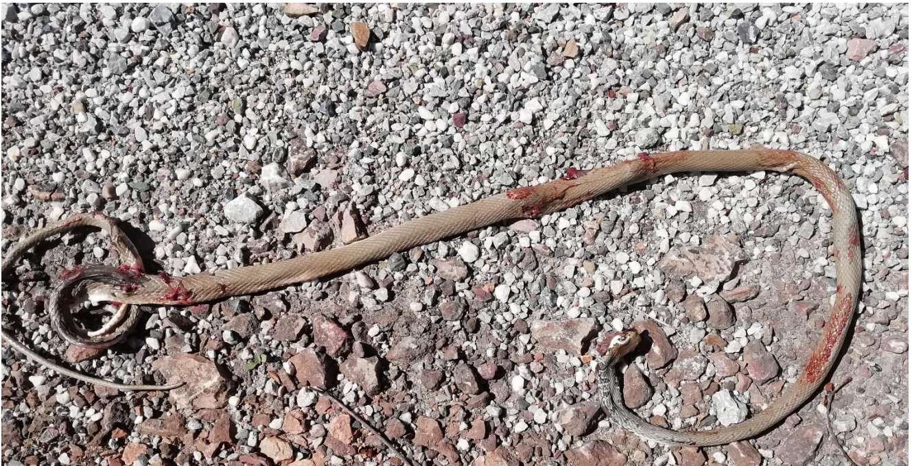
Figure 1. General view of the Platyceps najadum from Aşağıyanlar Village-Çankırı.

The colour of head is brownish. The ground colours of anterior and posterior of eyes are white. Dorsum colour of anterior of body is greyish with dark greyish spots on flanks. The rest of the dorsum is lighth brownish. Colour of the ventralia is yellowish (Figure 1).