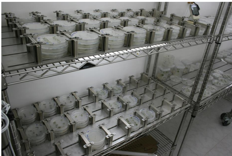
Figure 1. Magnetic field setup-50 mT (above), 100 mT (below left) and control (MF free) (below right).

conditions at 22 °C under a 16-h photoperiod (Figure 2d). The rooted plants had 80% survival rate through the hardening off process. Similar to our result, Tavares et al. [19] showed that roots were developed in MS medium alone or supplemented with IBA or NAA. Meszaros et al. [20] also observed root development with PGR free medium. Meftahizade et al. [23] obtained the best root formation (3.2 roots) with 1 mg/L NAA. On the other hand, 7.75 roots were obtained with 1 mg/L NAA in our study (Table 4).