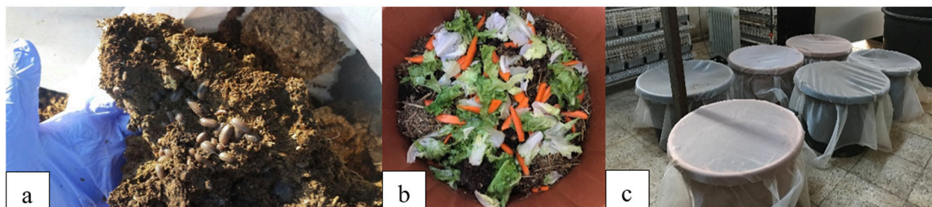
Figure 1. Preparation of isopod fertilizer: a) isopods, b) mixture, c) used pots and decomposing

The basic chemical properties of the agricultural soil and isopod fertilizer used in the experiments are presented in Table 1.