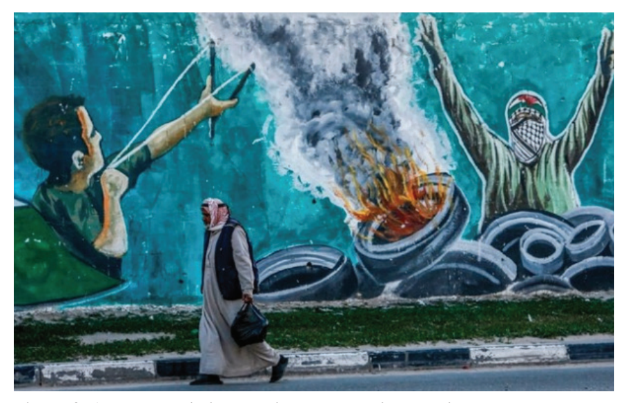
Figure-2: A mural depicting a resistance scene in Palestine

Despite such unfavorable developments, Palestinians have proven resilient in their determination to continue resistance, for which street art has been an essential instrument. Palestinian visual acts involve attempts to undermine occupation by painting murals suffused with symbolically powerful images in public space. One of the most expressive graffiti images sketched on the walls in Palestine is a well-known image of the Palestinian militant Leila Khaled. Khaled is known as a "heroine and iconic figure"<sup>39</sup> in Palestinian tradition of resistance. To counter Israel's attempts to portray Palestinian popular figures as terrorists, Palestinians have popularized one of Khaled's most remarkable images in their graffiti works. Khaled's image in Figure-1 indicates a facial expression that exudes hope and optimism and also "rejects the terrorist label."<sup>40</sup> Although her smiling face can be construed as a sign of hope aimed for Palestinians, the image does not omit her militant self, which is signified by the keffiyeh and gun and is clearly aimed at Israel