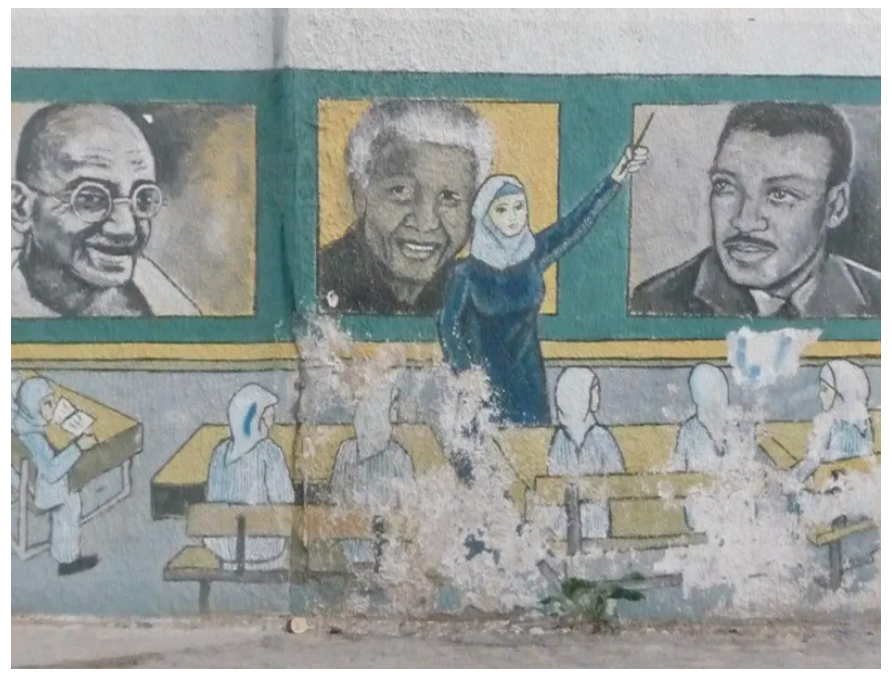
Figure-11: A Palestinian mural bearing the images of Mahatma Gandhi, Nelson Mandela and Martin Luther King

and Trump and the Palestinian cause."<sup>83</sup> As a result of such graffiti pictures, sites such as the Separation Wall "risks becoming a street art gallery rather than actually politicising what it is about", as put by a British tourist visiting the site.<sup>84</sup>