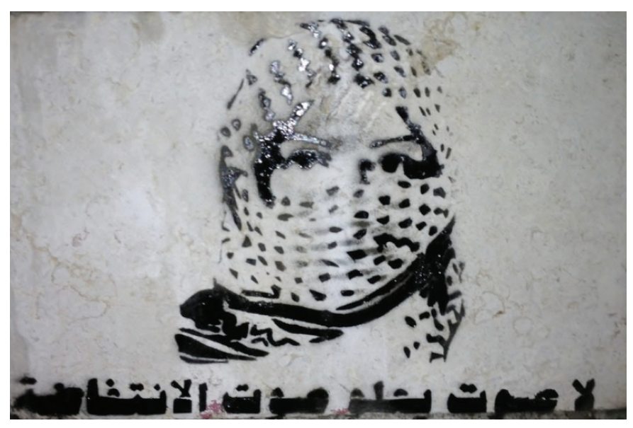
"There's no voice greater than the voice of the intifada" Figure-4: The keffiyeh-clad woman

"graffiti signatures as "totemic" [...] symbols of group belonging and sentiment." From this perspective, graffiti images must be understood as devices that contribute to the emotional-motivational unity of Palestinians, despite the physical-territorial disunity that afflict their lives.