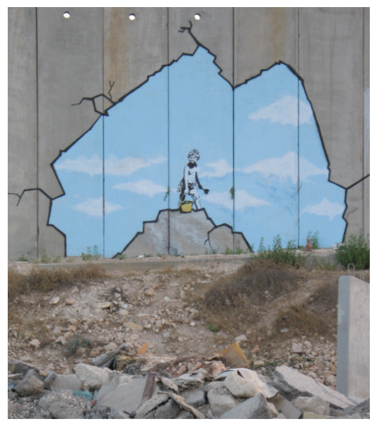
Figure-8: A Banksy mural on the Separation Wall

opportunity to show their solidarity with Palestinians. Of all the foreign artists appearing in the Palestinian street art scene, British street artist Banksy merits special emphasis, as his aesthetic murals on the Separation Wall have attracted considerable international attention due to wide press coverage. Despite the international spotlight afforded to Banksy's works, they did not always resonate well with the local population, with some expressing their displeasure at "his aestheticization of their suffering."