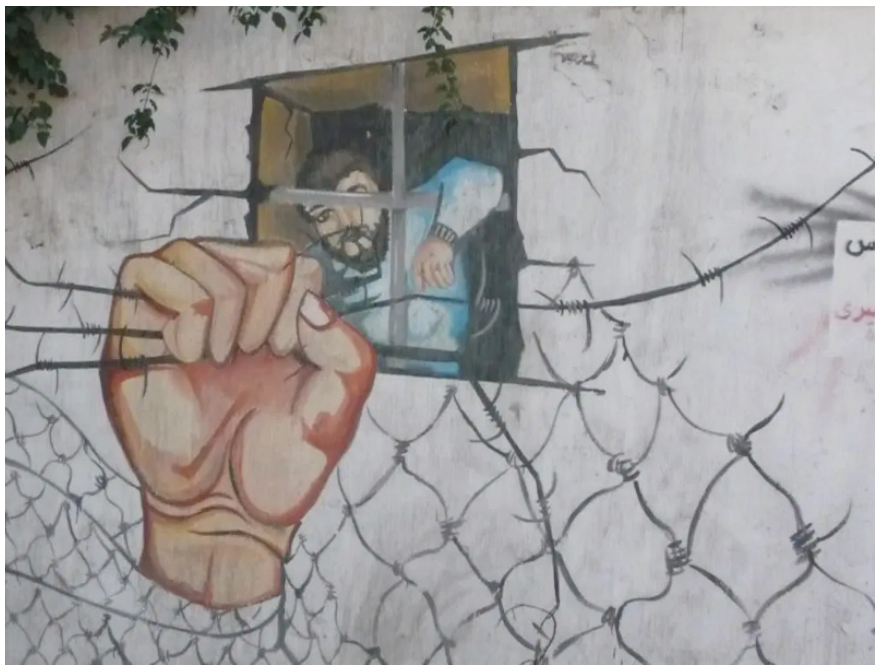
Figure-3: A hand on barbed wire image from Gaza

The Palestinian street art scene also features murals that depict the resisting Palestinian subject in the form of using a slingshot, burning tires or making a V-sign. Portraying these acts in a graffiti form, Figure-2 provides a powerful snapshot of Palestinian defiance and evidently conveys the message that circumstances necessitate resistance. As the acts depicted in Figure-2 represent gestures of resistance that are deeply rooted in the Palestinian struggle, such graffiti works also serve to refresh memories of liberation struggle.