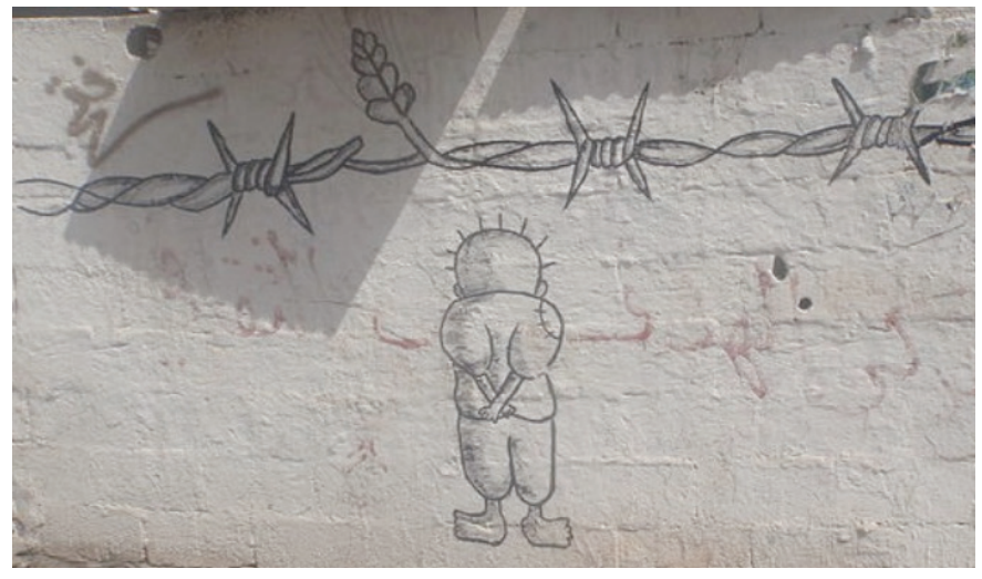
Figure-6: The Handala image

Given this background, Palestinians' attempts to build their own visual vocabulary must be viewed as an endeavor that is aimed at undermining Zionism's political imagination. Indeed, visual and textual elements populating Palestinian settings carry strong political overtones such that they reflect a determination to assert the Palestinian subject's political existence in connection with the broad goal of establishing a sovereign Palestinian statehood. Visual messages designed to convey Palestinian aspirations primarily stress Palestinians' dedication to recover their inherent rights over the historic land of Palestine. This is revealingly demonstrated by the key symbol. As well as signifying Palestinian uprootedness, this symbol is also representative of Palestinians' determination to acquire the right of return. As the right of return has been has been one of the most contentious issues between the Israeli and Palestinian sides, through their consistent use of the key symbol in their visuals, Palestinians continue to remind Israel that they remain steadfast in their commitment to reclaiming their land.