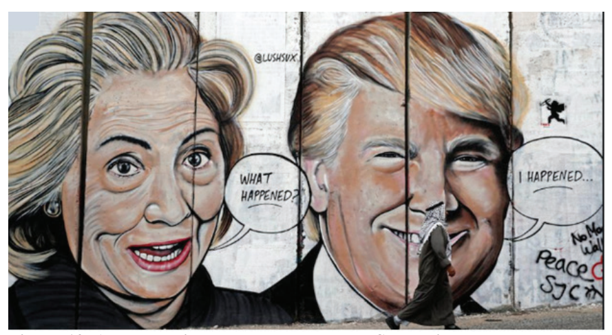
Figure-10: A mural painted by Lushsux on the Seperation Wall

Related to this discussion, some authors argue that works produced by foreign artists may even create an adverse impact on the effectiveness of Palestinian visual resistance. Referring to the Separation Wall's becoming of a popular street art site, Larkin, for example, asserts that "While the highly publicized work of graffiti artists such as Banksy, Blu, and Sam engage a global audience and provide a subversive snapshot of local realities, they may in some ways obscure the complexity of everyday Palestinian responses to the wall." Irrelevant content found in the works of foreign artists lends support to those who are wary of outside participation. For example, some Palestinians think that the Separation Wall "had become a symbolic space for a stream of passing visitors in which to act out their fantasies, aesthetic and political."