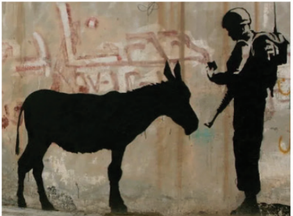
Figure-9: Two murals painted by Banksy in the West Bank Images taken from: Parry, Against the Wall, 51; https://www.jweekly.com/2018/07/13/banksy-in-the-west-bank-whose-art-is-it-anyway/

The participation of foreign artists in the Palestinian street art scene begs the overall question of whether their works make the intended positive contribution to the Palestinian cause. If viewed in a positive light, foreign artists' presence in Palestine leads to a beneficial visual diversity, through which to appeal to audiences from different cultural backgrounds. Reaching out to greater number of people and raising their awareness about the Palestinian issue may potentially facilitate for Palestinians