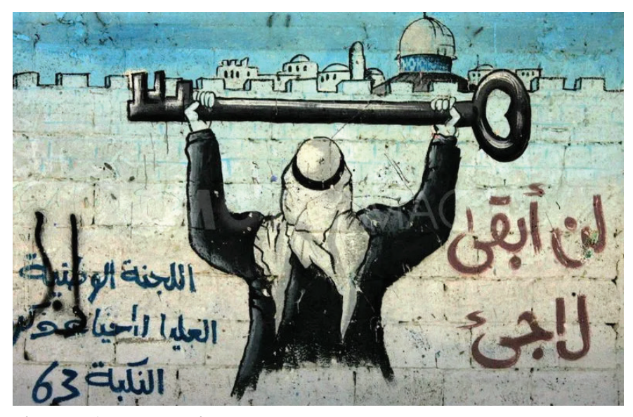
Figure-5: A mural bearing the key symbol

of creating meaningful representations with a constellation of symbols associated with Jewish tradition. For example, Yaakov Stark's mural known as "the First Monumental Zionist Work of Art", located in Jerusalem's Ades Synagogue, served as a source of inspiration for "Zionism's visual language", since it is laden with historically meaningful signs and symbols such as "the Hebrew letters, the Star of David, the menorah, the flora of the land of Israel, the symbols of the Israelite tribes [and] the zodiac." Of these symbols, the Star of David and the menorah became the emblems of the new nation and Jewish sovereignty respectively. Stark's mural was followed by other artworks that contained a "repertoire of emblematic, idyllic and often non-specific images of the country as produced by Jewish artists in Palestine during the 1920s." Attempts at constructing meaningful illustrations contributed to the constitution of the symbolic foundation of the soon to be established State of Israel.