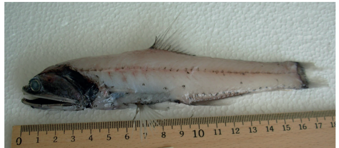
Figure 3. Lampanyctus crocodilus (Risso, 1810) in the North-eastern Mediterranean.