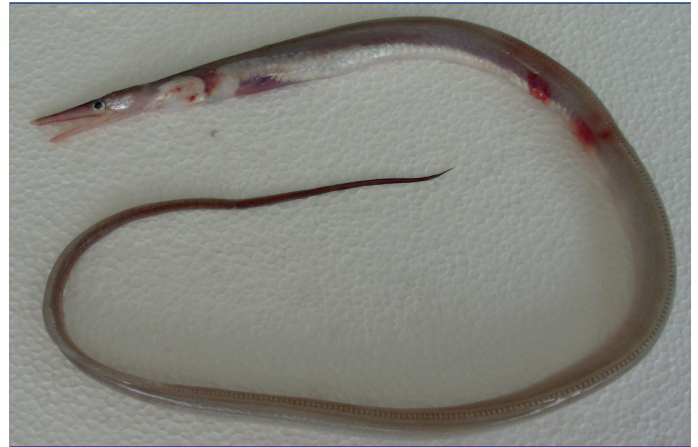
Figure 2. Nettastoma melanura Rafinesque, 1810 in the North-eastern Mediterranean.

Lengths (TL) and weights (g) of a total of 102 fish specimens belonging to 3 fish species from 3 families were measured, recorded and analyzed (Figure 2, Figure 3, and Figure 4). The sample size, minimum maximum length as well as the LWRs, the coefficient of determination ( r^2 ), the standard error and confidence interval (CI) of b for each species are presented in Table 1.