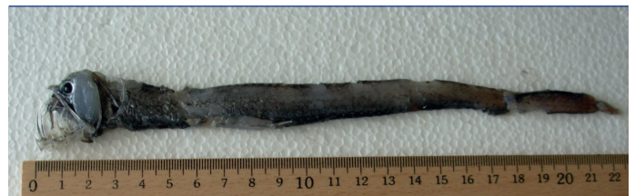
Figure 4. Chauliodus sloani Bloch & Schneider, 1801 in the North-eastern Mediterranean.

The exponent b often has a value close to three, but varies between two and four (Tesch 1971). In the present study, b values (based on TL) of the N. melanura species were negative allometric growth for males, females and sexes combined ( b < 3 ). However, b values of L. crocodilus and C. sloani were positive allometric growth for males, females and sexes combined ( b > 3 ), ( t -test: p < 0.05 ).