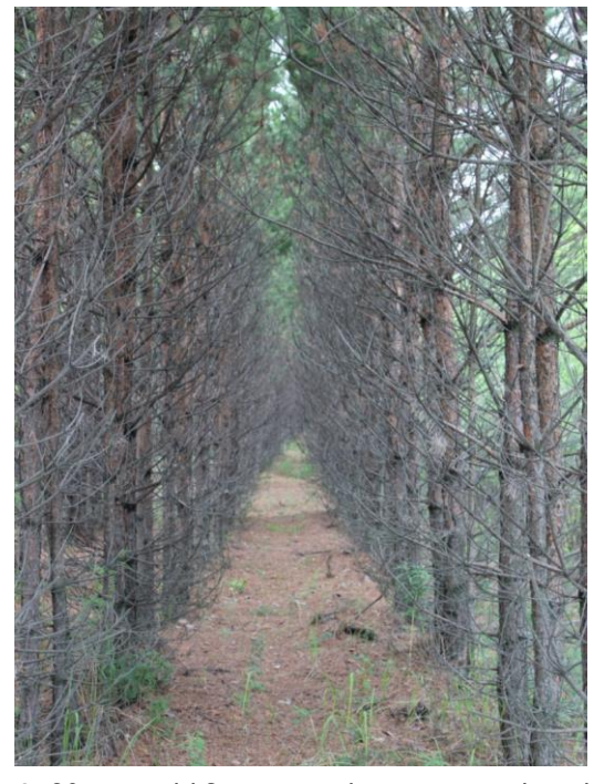
Figure 3. 20-years old Scots pine plantations on the ash dump of Reftinskaya power plant

At the age of 20 artificial stands are characterized by 143 m^3 /ha stem volume that corresponds to yearly increment of 7.15 m^3 /ha. In other words, artificial stands established on the ash dump exceed the stands of analogous age established on felled sites of the most productive forest types (Table 6). In addition, it can be seen that the stand volume, diameter and height change according to plantation age (Figure 4).