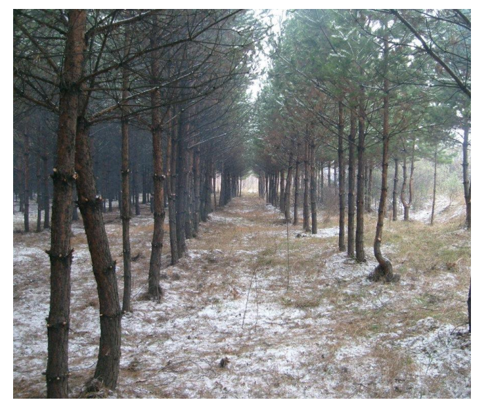
Figure 6. 20-years old Scots pine plantation with trimmed branches (Photo by: S. Zalesov)

The state of the path network, the removal of living ground cover and trimming of the lower branches excludes the possibility of the transfer of grassroots ground fire to the tree crowns.