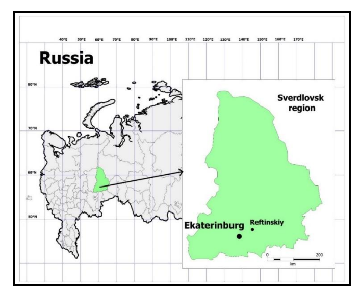
Figure 1. Map of the study area

The investigations carried out have shown that ash in the ash dump N<sup>o</sup> 1 is characterized by heightened as compared with soil, content of microelements as well as available nutrition elements of plants ( P_2O_5 and K_2O ). Weak alkaline reaction of ash spread by wind promoted soil dioxidation that results in soil fertility increasing significantly on territory of adjacent stands. The forest management plans data of Sukholorhsky forest district testify to the fact that growth site index capacity in the forest district where Reftinskaya power plant is located has been changed from 1970 to 2000. If in 1970 the Scots pine ( Pinus sylvestris L.) stand share of l<sup>a</sup> and I classes of growth site index capacity constituted 17.9%, in 2000 the Scots pine plantations share in these growth site classes shows portion of 43.6% (Table 1).