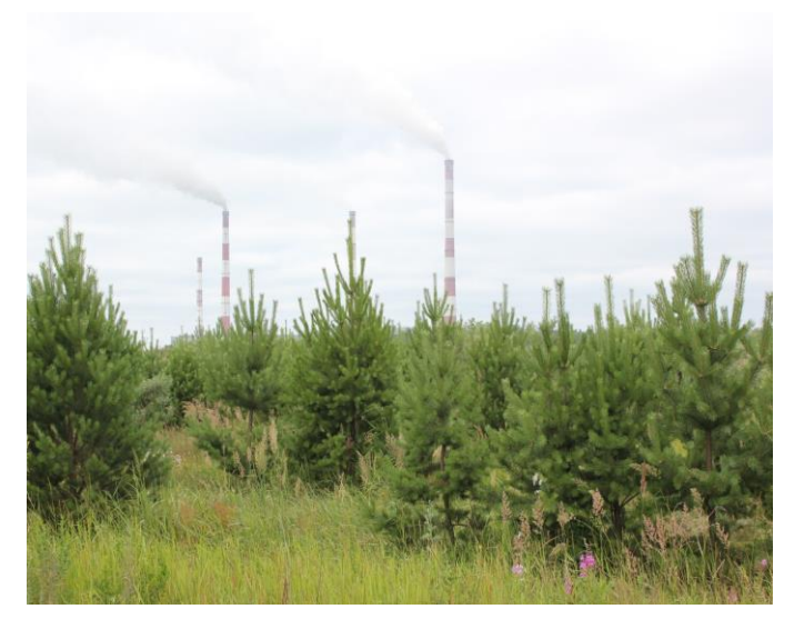
Figure 2. Establishment of Scots pine plantation on the ash dump of Reftinskaya power plant

In 2011, Reftinskaya power plant ash dump N _{\rm 1} recultivation was entirely completed. On its territory, a total of 360.2 ha of pine stands have been established (Figure 2, 3).