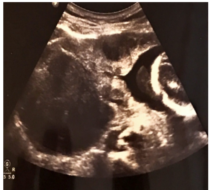
Figure 1. Ultrasonographic image of a 10 × 11 cm myoma in the cervix. Although the procedure was complicated due to the large cervical myoma in this patient who had developed cervical insufficiency, the McDonald cerclage procedure was successful.

obstetric ultrasonography. Fetal movements and cardiac activity were positive. The amniotic fluid was normal. The cervical canal length could not be clearly evaluated due to the cervical myoma. On vaginal examination, the cervix was 3 cm dilated and 50–60% effaced. Biochemical and urinalysis tests were within normal limits. No fetal anomaly was detected on ultrasonography, and it was decided to perform an emergency cervical cerclage. The major problem was the large myoma in the cervical canal. A McDonald cerclage technique was performed; the cervix was sutured with a mersilene type cerclage suture at the 4-7-12 positions. Prophylactic antibiotherapy was initiated, tocolysis was administered, and the patient was hydrated. At about 33 weeks gestation, the patient started the early stages of labour, and because the birth canal was closed by the cervical myoma, caesarean section was performed, with the safe birth of a 2250 g baby. The myoma was not removed due to its location and the risk of bleeding during the caesarean section.