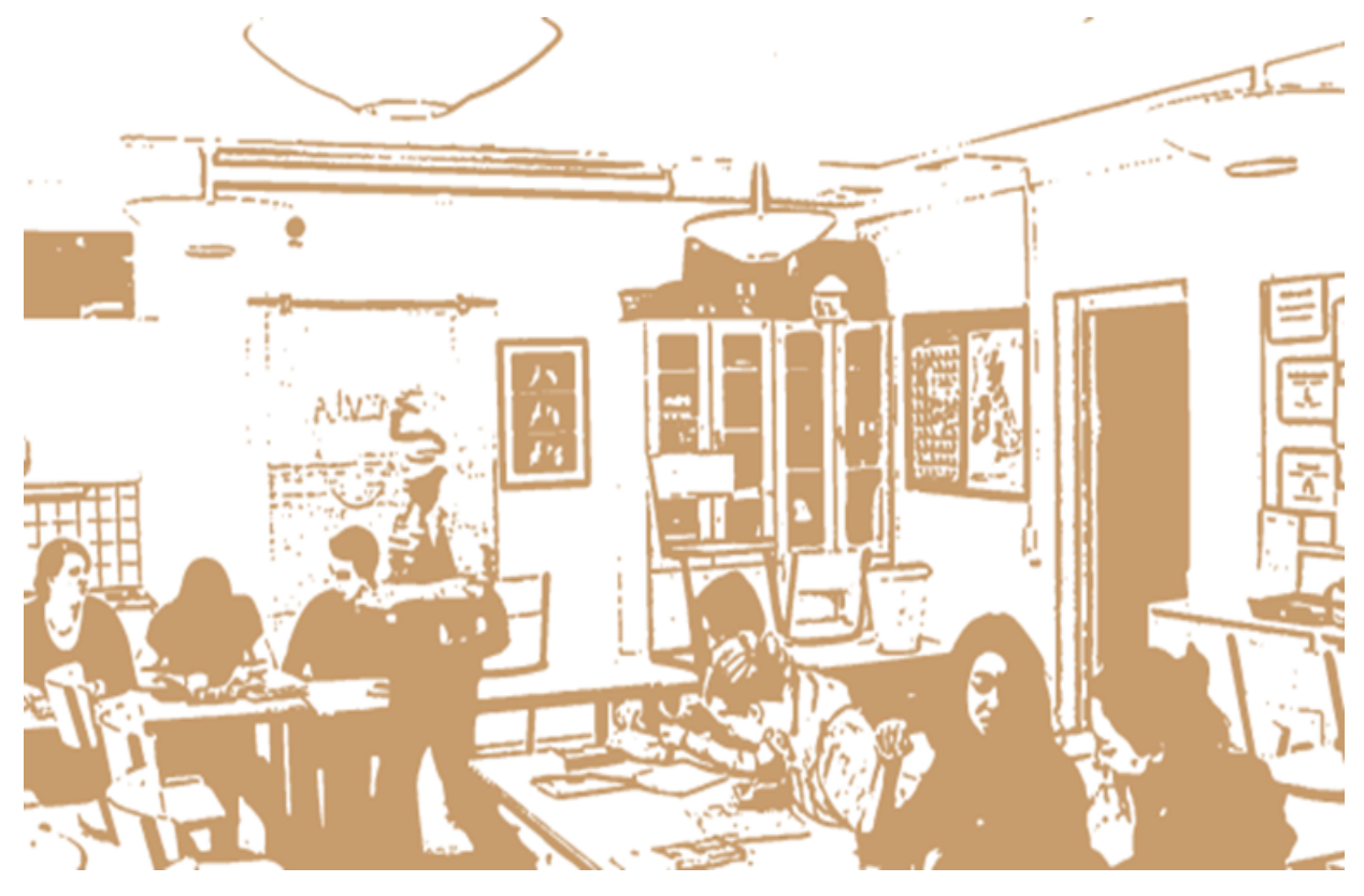
Figure 1. Hi, Good morning (line 4)