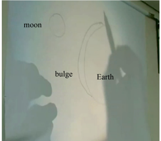
Still 2: Lucas' drawing (description added by MK)

In the course of the following interaction, Lucas deploys a cluster of verbal, para-verbal, and nonverbal resources to provide the explanation requested by the teacher. The finely tuned intrapersonal coordination of these resources shall be demonstrated by three examples in section 4.1. In section 4.2, the collaborative aspect of the activity will be looked at.