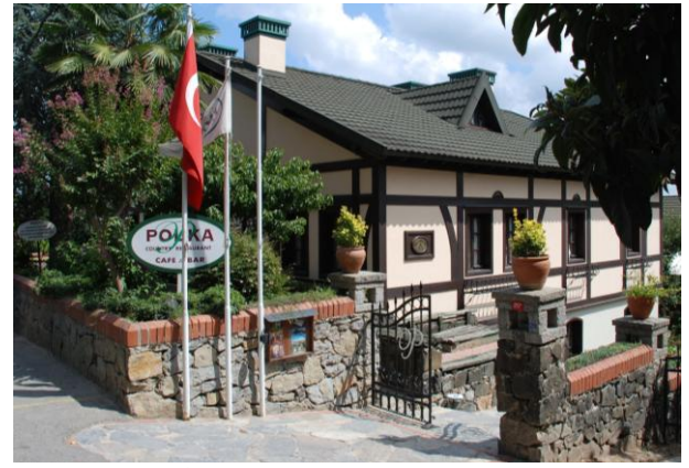
Figure 3. Polka Hotel (Şekil 3. Polka Otel)