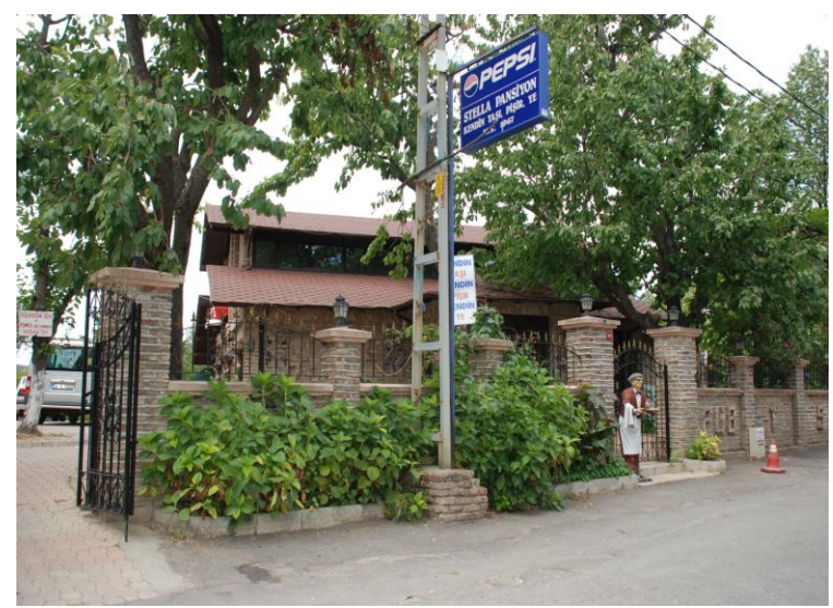
Figure 1. Stella Boarding House (Şekil 1. Stella Pansiyon)