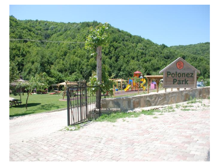
Figure 7. One of the picnic park in the forest entered against an entrance fee (Şekil 7. Orman içinde oluşturulan giriş ücreti ödenen piknik parklardan biri)