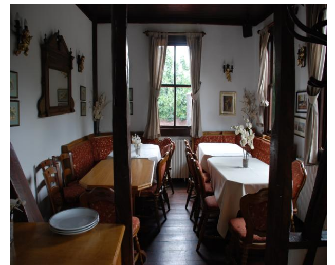
Figure 6. An internal view of Leonardo Restaurant (Şekil 6. Leonardo Restaurant'ın iç görünümü)

In addition to the second homes and restaurants, there are other units, which can be included in the complementary ones, with facilities such as café, picnic park, walking-running and cycling tracks, paintball, golf and tennis. Among them, the picnic parks in the forest surrounding the village are generally preferred by families with children. Fenced in and entered by paying an entrance feel, these parks have facilities such as garden chess, basketball court, and ornamental pool, picnic area sitting groups, playing tools for children, café-restaurant and car park. Furthermore, some parks have mini zoos containing camel, fallow deer, lama, ostrich, sheep, goad, pig and a variety of birds.