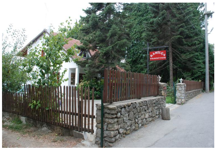
Figure 2. Kamilça Boarding House (Şekil 2. Kamilça Pansiyon)

Following the boarding houses, the hotels (7 units) constitute the important accommodation facilities of the village. While most of them are built directly as hotel, there are small number of hotel, which were converted from the former boarding houses. Polka Hotel is one of the hotels, which underwent such conversion. Providing service as Polka Boarding House since 1905, the building was restored and became hotel in 1996. Polka Hotel is also the first and single hotel granted with "tourism operation license". Just like the boarding houses, the hotels also operate in the buildings, not multi-storey, and reflecting general architecture of the village. Besides their size, they draw attention with their operating structure offering a number of accommodation facilities. Among these facilities are accommodation in the rooms, breakfast, brunch, restaurant and bar, café, indoor and outdoor swimming pool, basketball, football and volleyball fields and courts, children's park, garden, picnic area and car park services.