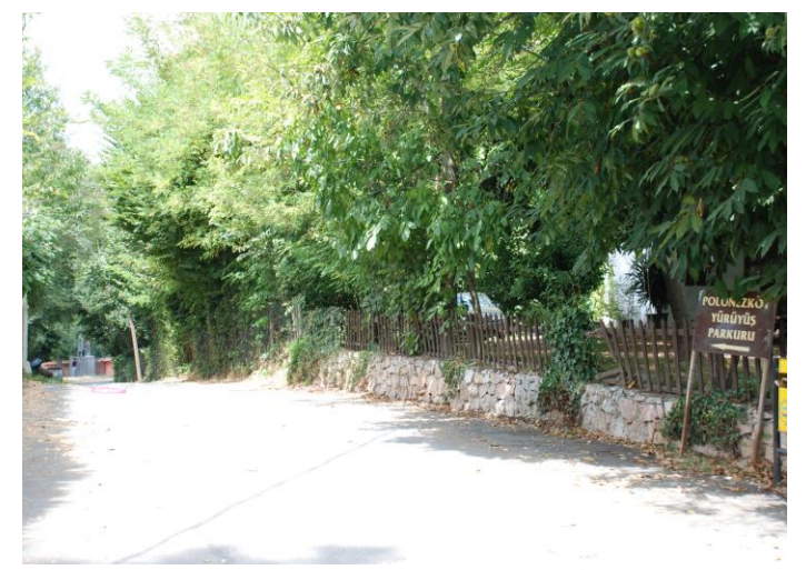
Figure 10. Start of the walking track (Şekil 10. Yürüyüş parkuru başlangıcı)