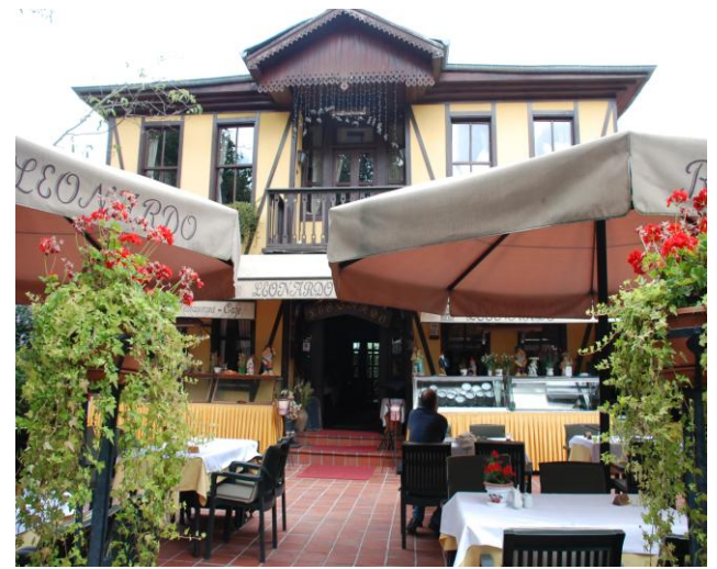
Figure 5. Leonardo restaurant (Şekil 5. Leonardo restaurant)