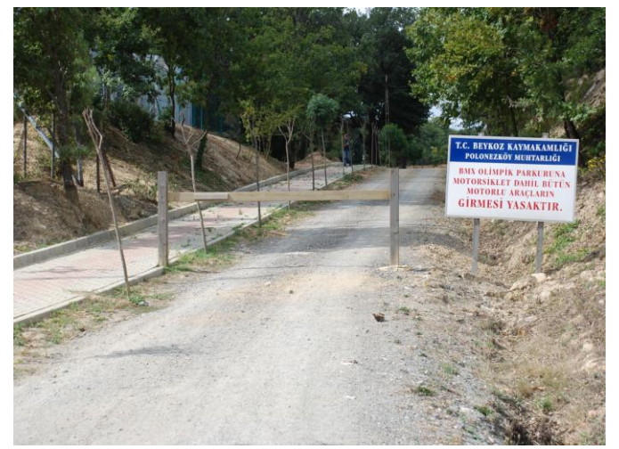
Figure 11. Cycling track (Şekil 11. Bisiklet parkuru)

For lunch and dinner, restaurants offer very different alternatives (home-made horsdoeuvre and meals from Polish cuisine) or barbecue type menus in the gardens.