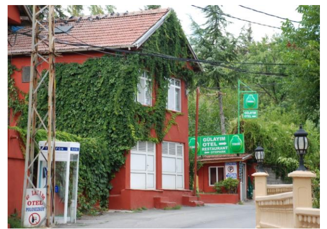
Figure 4. Gülayım Hotel (Şekil 4. Gülayım Otel)

These facilities, running for seasons, offer room options to the local and foreign guests (rooms with Jacuzzi, detached and standard) as well as comfortable accommodation facilities in all rooms such as telephone, wireless internet, hair dryer, TV set, central heating, air-conditioner and steel safe).