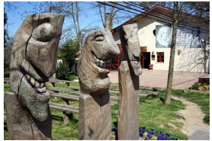
Figure 12. Woodcarving exhibition in front of the Cultural House (Şekil 12. Kültür Evi önündeki ağaç oyma sergisi)