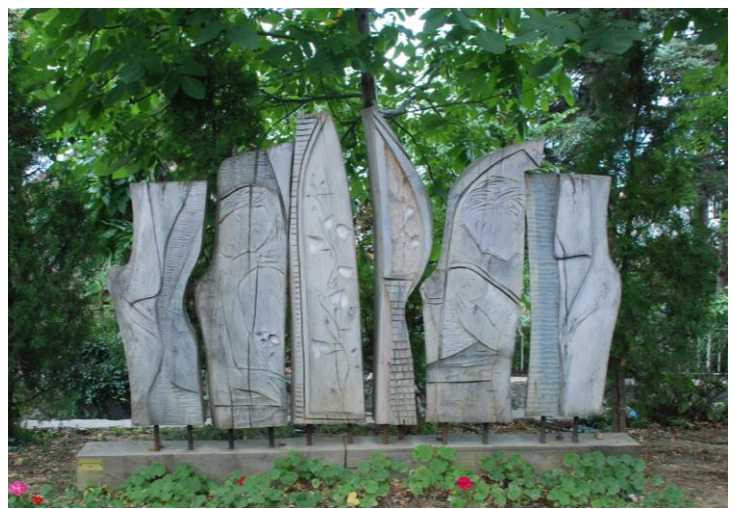
Figure 13. Woodcarving exhibition in front Of the Cultural House (Şekil 13. Kültür Evi önündeki ağaç oyma sergisi)

As an important economic activity in the village, sale of souvenirs is concentrated in the village square; the people visiting the village at the weekend may do the shopping in the market where local food is sold. Furthermore, in the evening hours (when the visitors on their way home), small stalls set at the exits of the village and along the road in the forest offer fresh vegetables, fruits and egg.