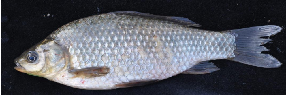
Figure 5. Carassius gibelio , IFC-ESUF 03-1612, 173.1 mm SL