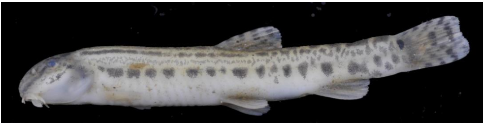
Figure 16. Cobitis splendens , IFC-ESUF 18-0007, 85.6 mm SL