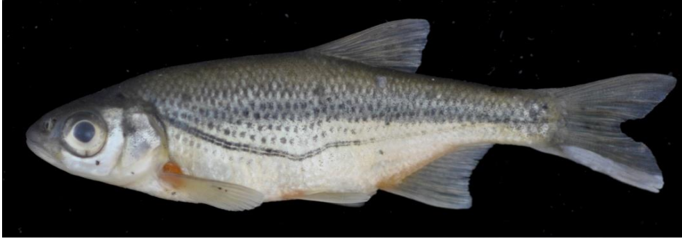
Figure 13. Alburnoides koskuncelepii , IFC-ESUF 03-1215, 78.2 mm SL