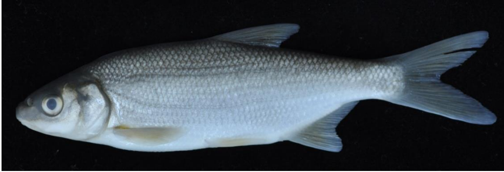
Figure 10. Vimba vimba , IFC-ESUF 03-1133, 189.3 mm SL