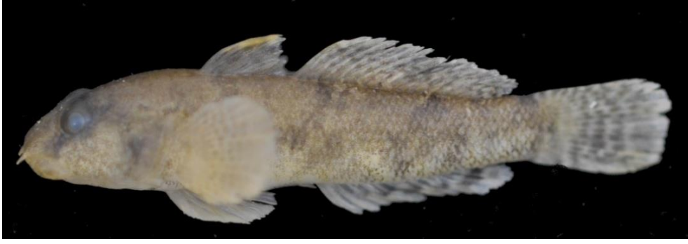
Figure 18. Proterorhinus semilunaris , IFC-ESUF 20-0004, 110.3 mm SL