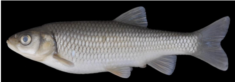
Figure 7. Squalius pursakensis , IFC-ESUF 03-0854, 13.4 mm SL