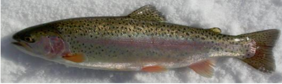
Figure 14. Oncorhynchus mykiss , IFC-ESUF 02-0020, 191.3 mm SL