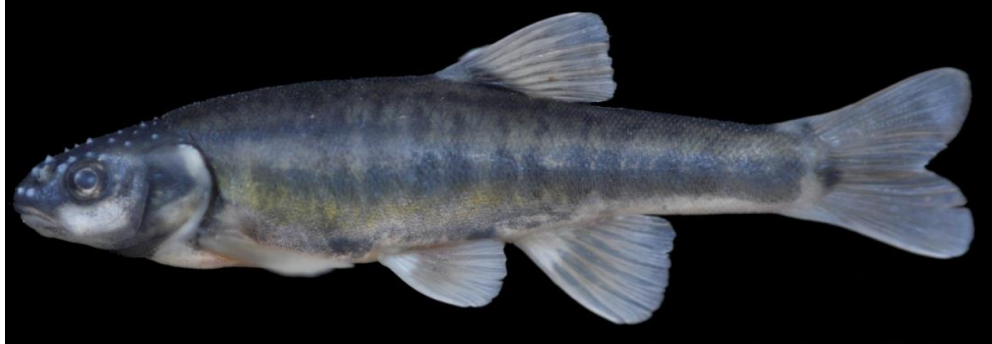
Figure 6. Phoxinus strandjae , IFC-ESUF 03-1801, 71.6 mm SL