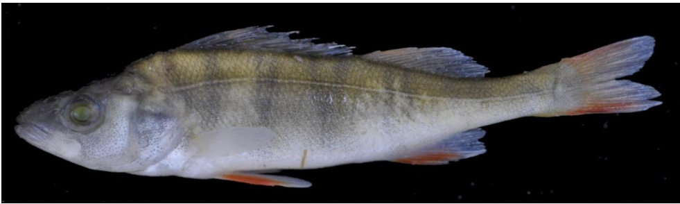
Figure 15. Perca fluviatilis , IFC-ESUF 08-0006, 146.7 mm SL