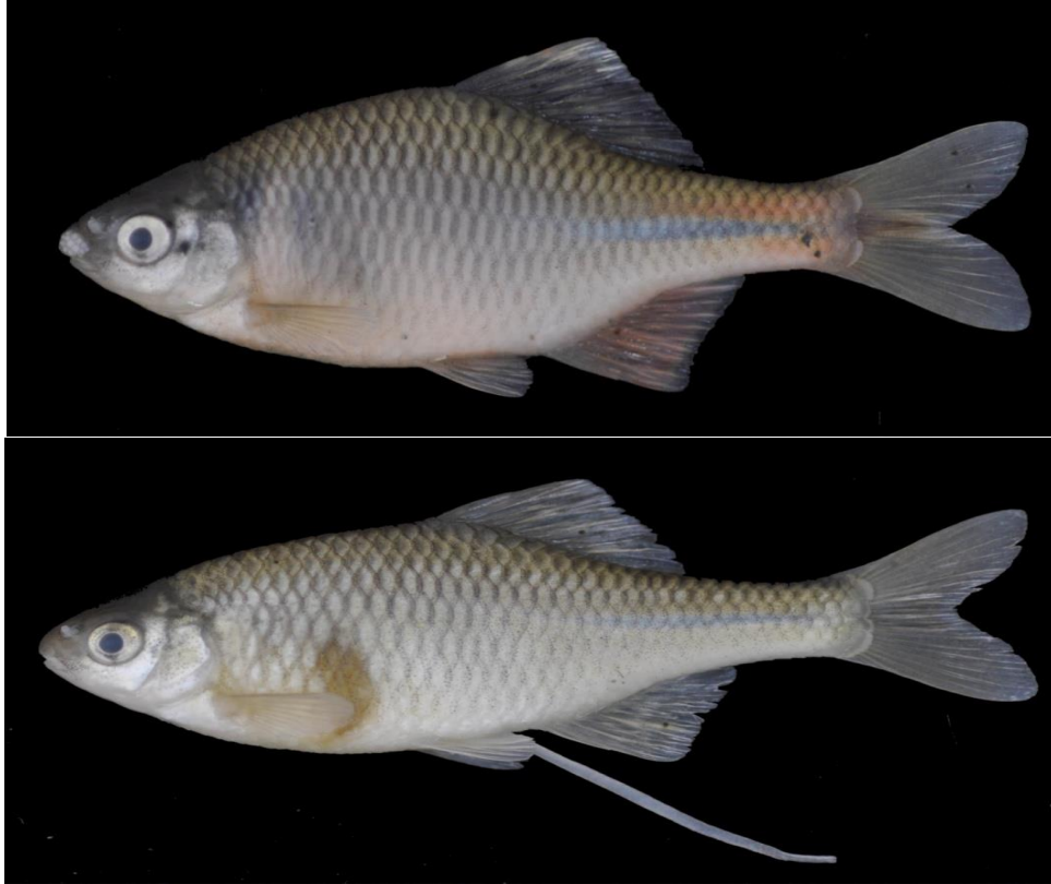
Figure 2. Rhodeus amarus , IFC-ESUF 03-1406, 45.6 mm SL ♂- 42.4 mm SL ♀

17 species belonging to 9 families (Salmonidae (1 taxa), Acheilognathidae (1 taxa), Cyprinidae (2 taxa), Gobionidae (1 taxa), Leuciscidae (7 taxa), Tincidae (1 taxa), Cobitidae (1 taxa), Percidae (1 taxa), Gobiidae (2 taxa)) were identified from the Düzce Province (Table1, Figure 2-18).