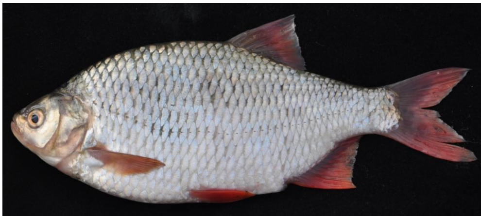
Figure 4. Scardinius erythrophthalmus , IFC-ESUF 03-1850, 190.2 mm SL