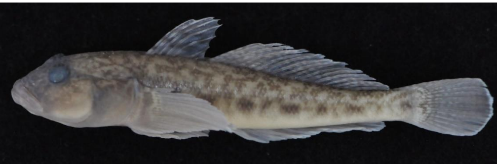
Figure 17. Neogobius fluviatilis , IFC-ESUF 20-0003, 110.5 mm SL