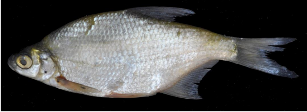
Figure 9. Blicca bjoerkna , IFC-ESUF 03-1825, 50.0 mm SL