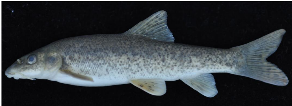
Figure 11. Barbus tauricus , IFC-ESUF 03-0517, 172.5 mm SL