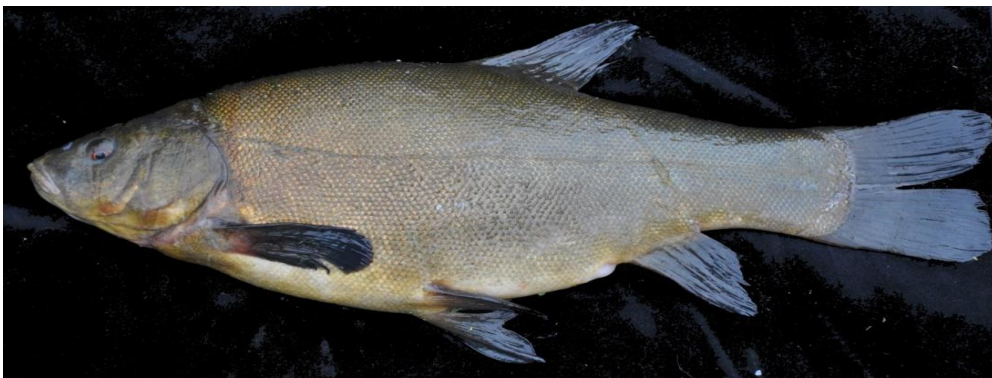
Figure 8. Tinca tinca , IFC-ESUF 03-1102, 261.1 mm SL