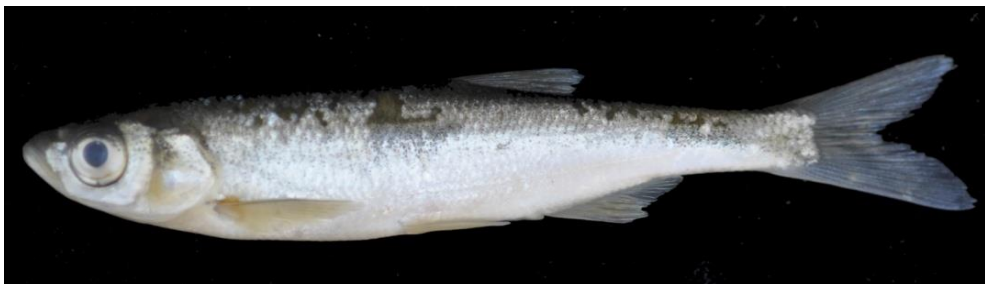
Figure 12. Alburnus derjugini , IFC-ESUF 03-0382, 128.1 mm SL