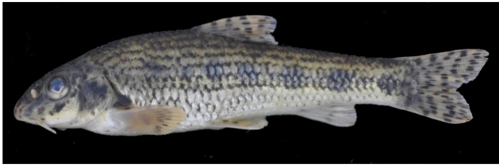
Figure 3. Gobio baliki , IFC-ESUF 03-1702, 98.4 mm SL