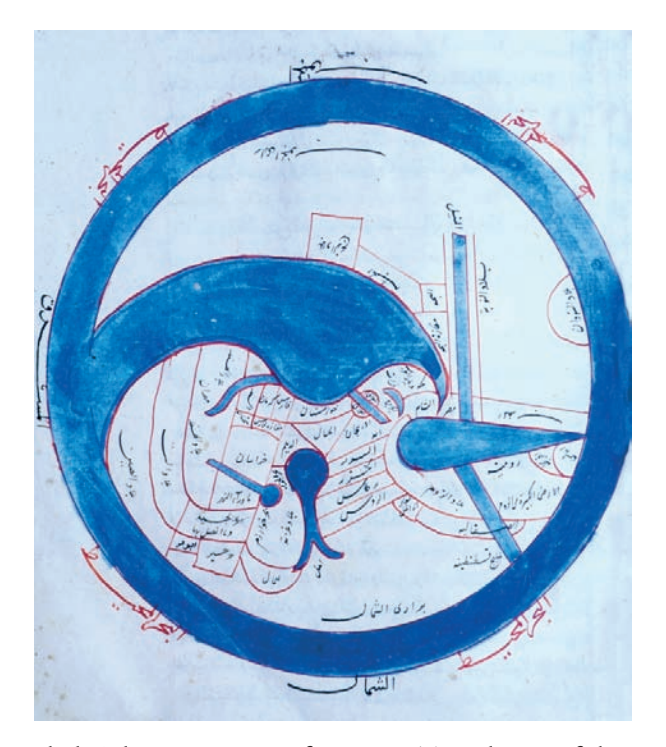
Figure 10 : Istanbul, Süleymaniye, Ayasofya 2971a: Typical Map of the World in Ottoman Cluster;<sup>66</sup> courtesy of the Süleymaniye Kütüphanesi

Although there seems to be no visual resonances between the Ottoman Cluster and the Piri Reis map, perhaps we can find a textual one. There is a strange reference to the Atlantic on Piri Reis' 1513 World map that many a scholar has puzzled over.