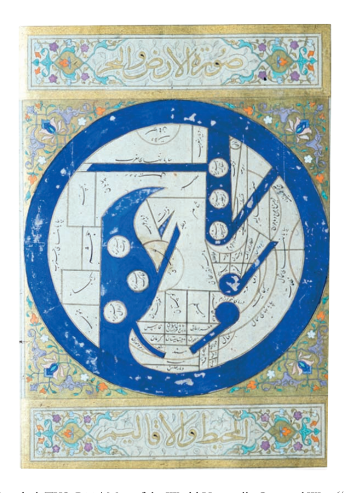
Figure 7: Istanbul, TKS: B334 Map of the World Unusually Oriented West; ^{64}