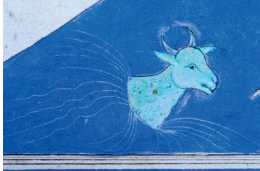
Figure 9: Comparison of Marine Cow in B334 and Unicorn Bull in Piri Reis Map