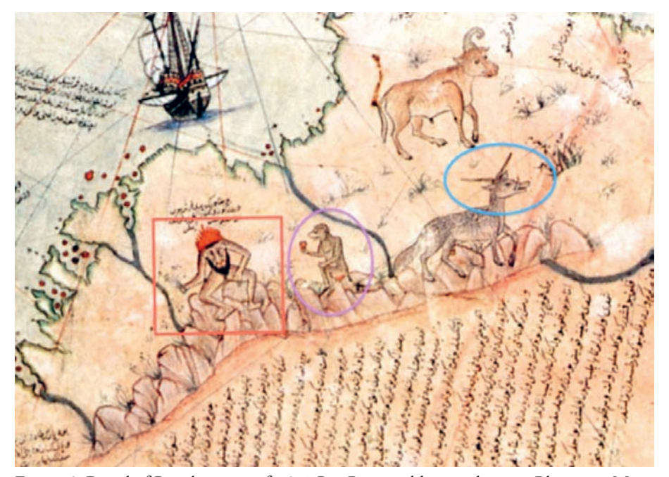
Figure 5 : Detail of Brazil section of 1513 Piri Reis world map, showing Blemmye, Monkey, Yale, and Unicorn–Bull.

of the map leads us to one highly plausible KMMS source: Bağdat 334 [hereafter B334], a late fifteenth/ early sixteenth century al-Istakhri manuscript located in the library of Topkapı Palace.<sup>48</sup>