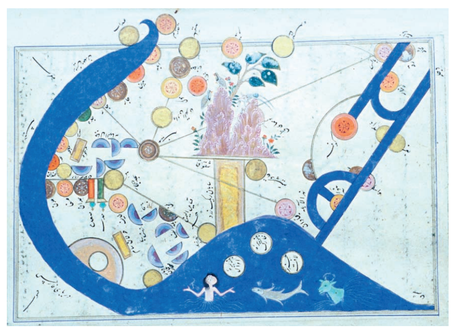
Figure 8: Istanbul, TKS: B334 Map of the Arabian Peninsula with Marine-Goat depicted as swimming in the Persian Gulf; courtesy of the Topkapı Sarayı Kütüphanesi.