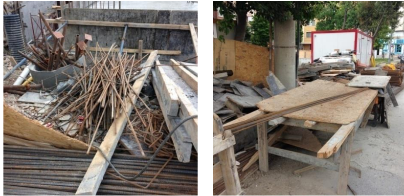
Fig 1. Waste generation during cutting of steel reinforcement for sizing (Site-8)

• According to Poon et al. [33], designing with standard sized building materials avoids cutting, and also design for flexibility reduces the generation of construction waste. Designing more flexible spaces, especially for commercial spaces, could be another measure to reduce MC1 for Istanbul. To reduce MC2-a, the use of standard products could be widespread for Istanbul.