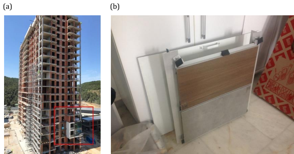
Fig 2. In-situ sample application on Site-1(a) and sample application on Site-3 (b)

• Procurement (MC9) is the least effective waste cause on-sites. As proposed by Poon et al. [33], clear records of purchase, delivery, usage and payment can avoid over-orders and supply material control.