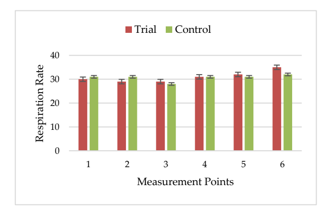
Figure 2. Respiratory rate per minuteafter the operative approach in Atropine treated and control cats.