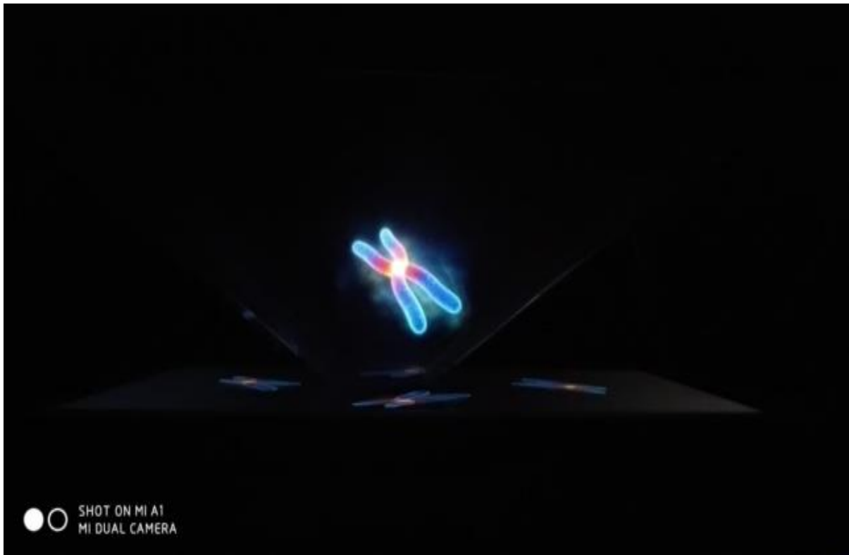
Figure 4. Chromosome