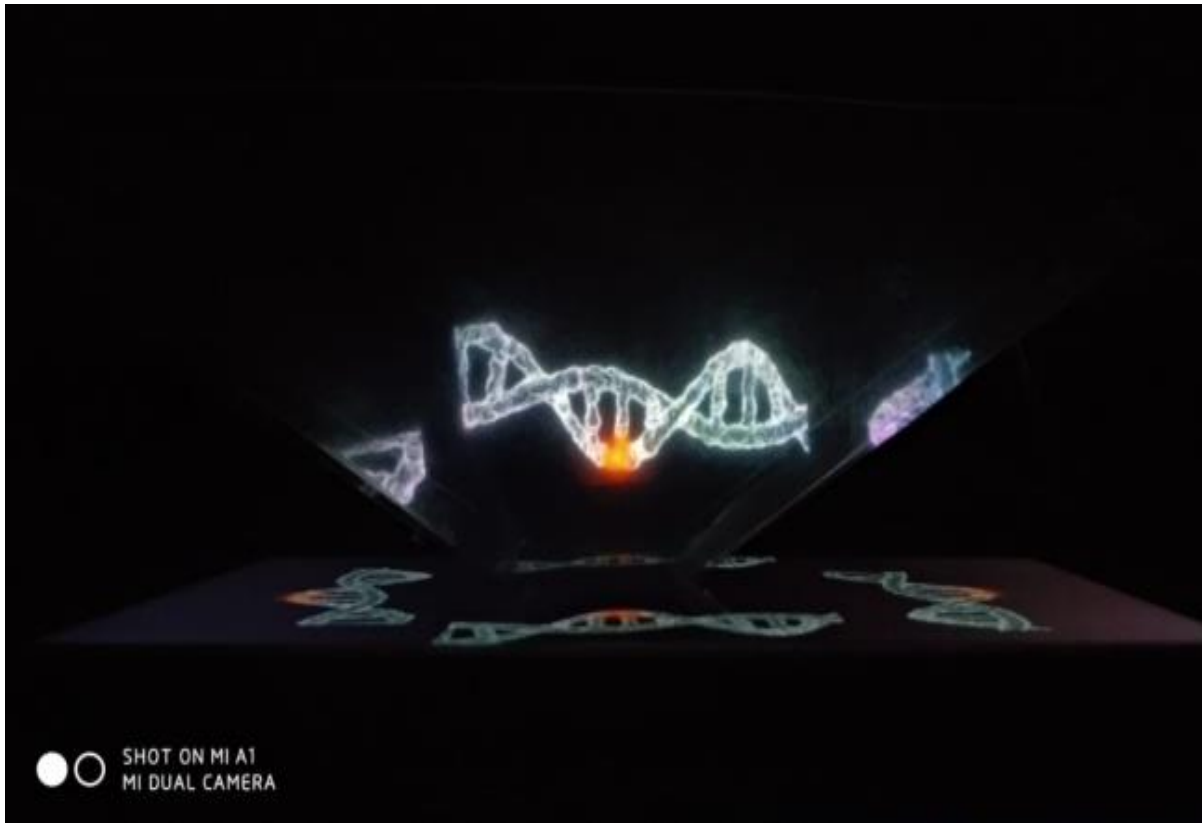
Figure 1. The Helix Structure of DNA

pyramids required for the use of digital hologram videos are designed by the students in the classroom. Students were given a ten-minute period in the lesson to design the hologram pyramids. During this period, the operation was smoothly processed by providing students with the information about the steps of hologram pyramid preparation. Then, hologram images on related topics were examined using the hologram pyramids prepared by the students. Digital hologram images used in the application process are shown in Figure 1-2-3-4.