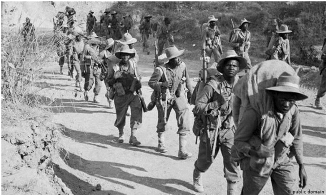
Figure 3: African Troops fighting in Burma (WW II)

Recorded historical accounts of conquests by Hannibal; the prowess of the Nubian warriors; the expansion of great kingdoms in the Saharan Desert; service in the armies of Southern India and the Moorish conquest of Spain all reveal that the role of the African soldier is as old as civilization. During the European wars, Africans were recruited in massive numbers to serve as foot soldiers for European and American armies. Despite being part of the war casualties, African servicemen nonetheless contributed to the creation of African diaspora.