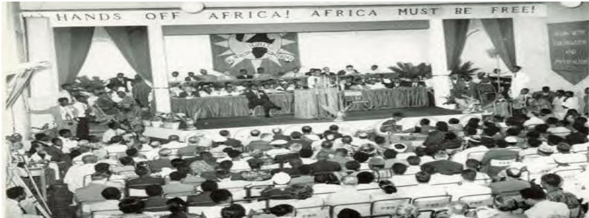
Figure 4: All African Peoples Conference in Accra