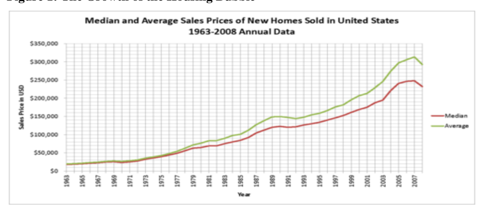
Figure 1: The Growth of the Housing Bubble

The Global Financial Crisis can be interchangeably called the credit crunch and is believed to be the most serious economic recession since the Great Depression of the 1930s (Krugman, 2009). This crisis was triggered by perceived deflation risk occasioning a rapid reduction in interest rates. This was followed by easy credit; increased debt burden; sub-prime lending; incorrect risk pricing and reduced liquidity in the banking system in the USA (Labaton, 2008). This led to the failure of major banking institutions triggering the onset of the Global Financial Crisis. The crisis was characterised by major declines in stock markets around the world with most governments conducting massive bailouts in for major financial institutions and corporate in an effort to return their economies to optimum levels (Steverman and Bogoslaw, 2008). The housing in the USA was also adversely affected with prolonged vacancies, foreclosures, and evictions rising to unprecedented levels. This led to the severe global recession in 2008. The USA housing bubble had peaked between 2005 and 2006 with prices being higher than the value of the assets (Roeder, 2011).