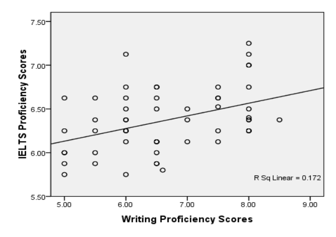
Figure 1. Bar graph based on writing proficiency of the instrumentally motivated candidates with their language proficiency

The following figure shows how the relationship between the variables is manifested. Figure 1 shows a positive linear correlation between the variables.