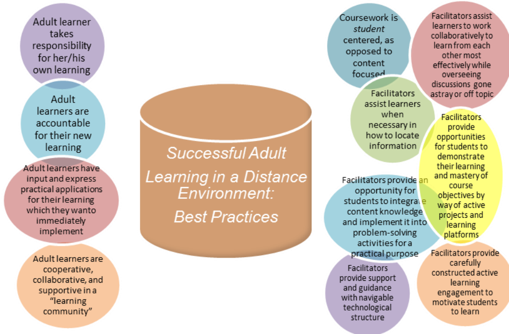
Figure 1. Proposed Model for Learning Success in a Student-Centered Adult Distance Learning Environment