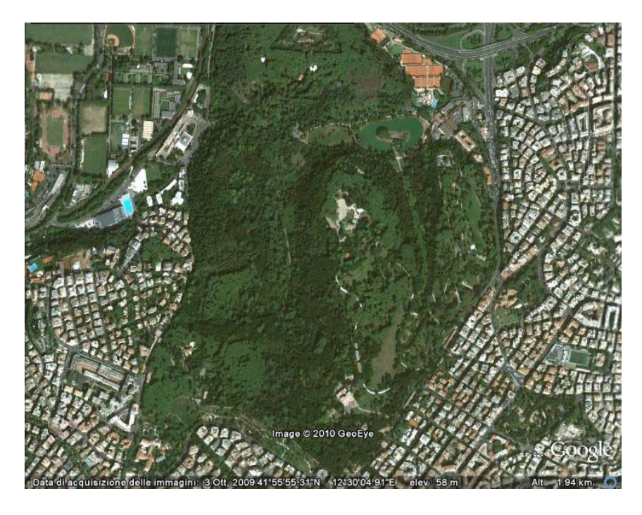
Figure 3. Villa Ada in a recent view