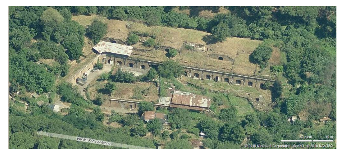
Figure 5. A detail of Villa Ada: the Forte Antenne