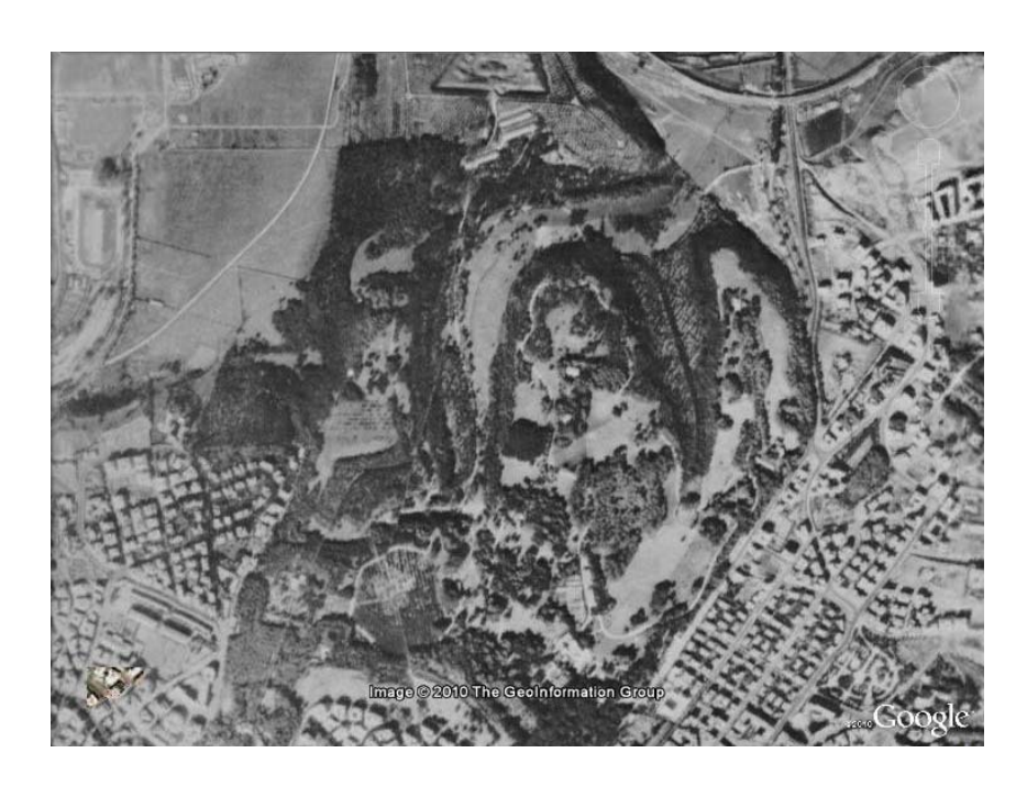
Figure 2. Villa Ada in a view taken in 1943