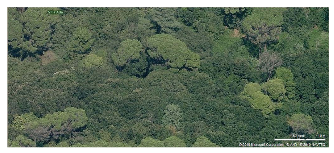
Figure 6. A detail of Villa Ada: the vegetation