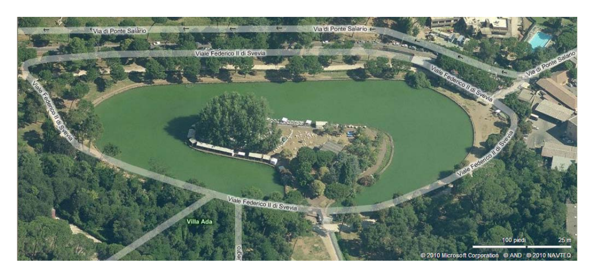
Figure 4. A detail of Villa Ada: the lake