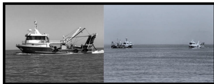
Figure 2. Fishing vessels used in the research

Laboratory and length and weight measurements were carried out in the laboratory.