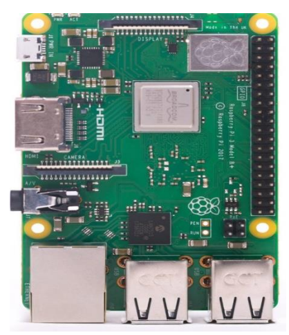
Figure 7. Image of Raspberry Pi (Model 3B+)