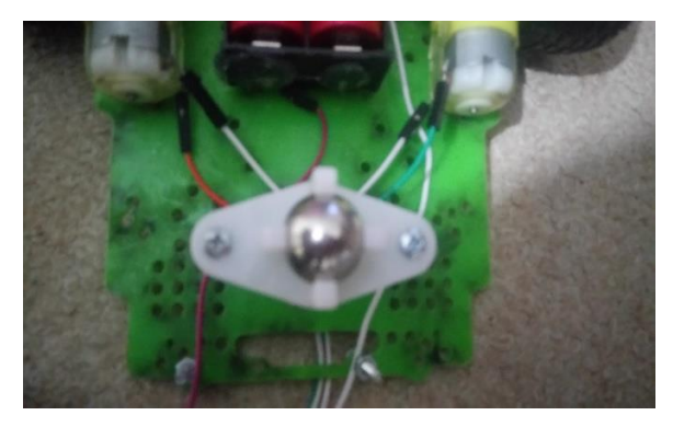
Figure 4. Image of the Drunken Wheel Integration to the Frame

After the wheels have been placed, a drunken wheel is integrated in the front-lower part of the chassis, which works in harmony with the other two rear wheels. The purpose of the use of the drunken wheel is to ensure that the movable platform is easily guided and can rotate freely in any direction. Figure 4 shows the image of the drunk wheel integrated into the frame.