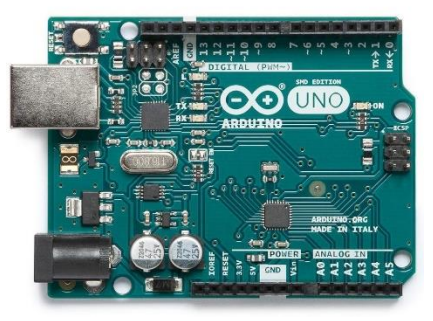
Figure 8. Image of Arduino UNO

In this project, Arduino UNO was used as the main micrcontroller of the mobile robot system.