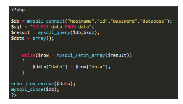
Figure 13. Example of Basic PHP Script Code of Database Connection and JSON Encoding.

database and shows these data to Raspberry Pi in a specific data format. Figure 13 illustrates an example PHP script of database connection and encoding of the data.