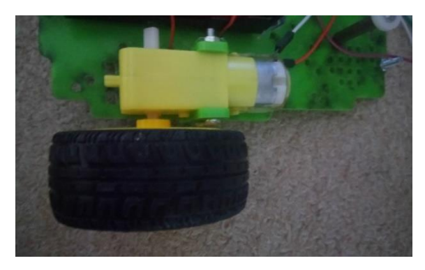
Figure 2. Image of the Right DC Motor and Wheel Integration to the Frame

After providing the frame of the mobile robot, DC motors are integrated into the spaces reserved for the two motors on the right and left sides of the bottom of this frame by screwing the DC motors. Figure 2 and Figure 3 shows the DC motors integrated into the right and left sides of the frame, respectively.