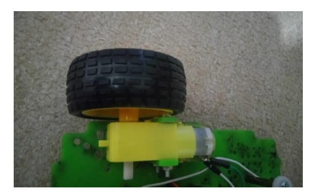
Figure 3. Image of the Left DC Motor and Wheel Integration to the Frame

After the wheels have been placed, a drunken wheel is integrated in the front-lower part of the chassis, which works in harmony with the other two rear wheels. The purpose of the use of the drunken wheel is to ensure that the movable platform is easily guided and can rotate freely in any direction. Figure 4 shows the image of the drunk wheel integrated into the frame.