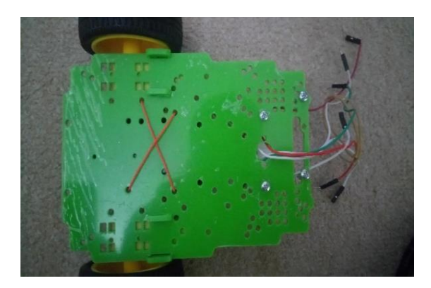
Figure 1. The Image of the Frame

Firstly, there is a need for DC motors, batteries for the power supply of the motors, wheels, power supply encoder module, and a platform where the Arduino will stand together. Therefore, in the design of the mobile robot, a frame (chassis) is needed in which these equipment will be kept together. Figure 1 shows the image of the skeleton used in the design of the robot.