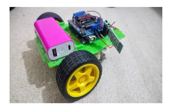
Figure 17. Image of the Mobile Robot