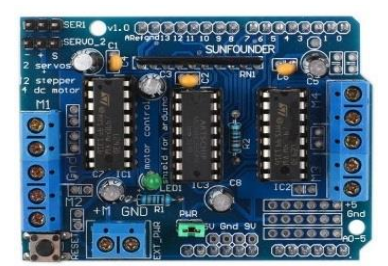
Figure 9. Image of the L293D Motor Driver Module

features two L293D Motor Driver Controller and a 74HC595 Shift Register. Shift Register increases the number of pins from 3 to 8 to control the motor direction and two L293D Motor Driver provides the main functionality of controlling the motors.